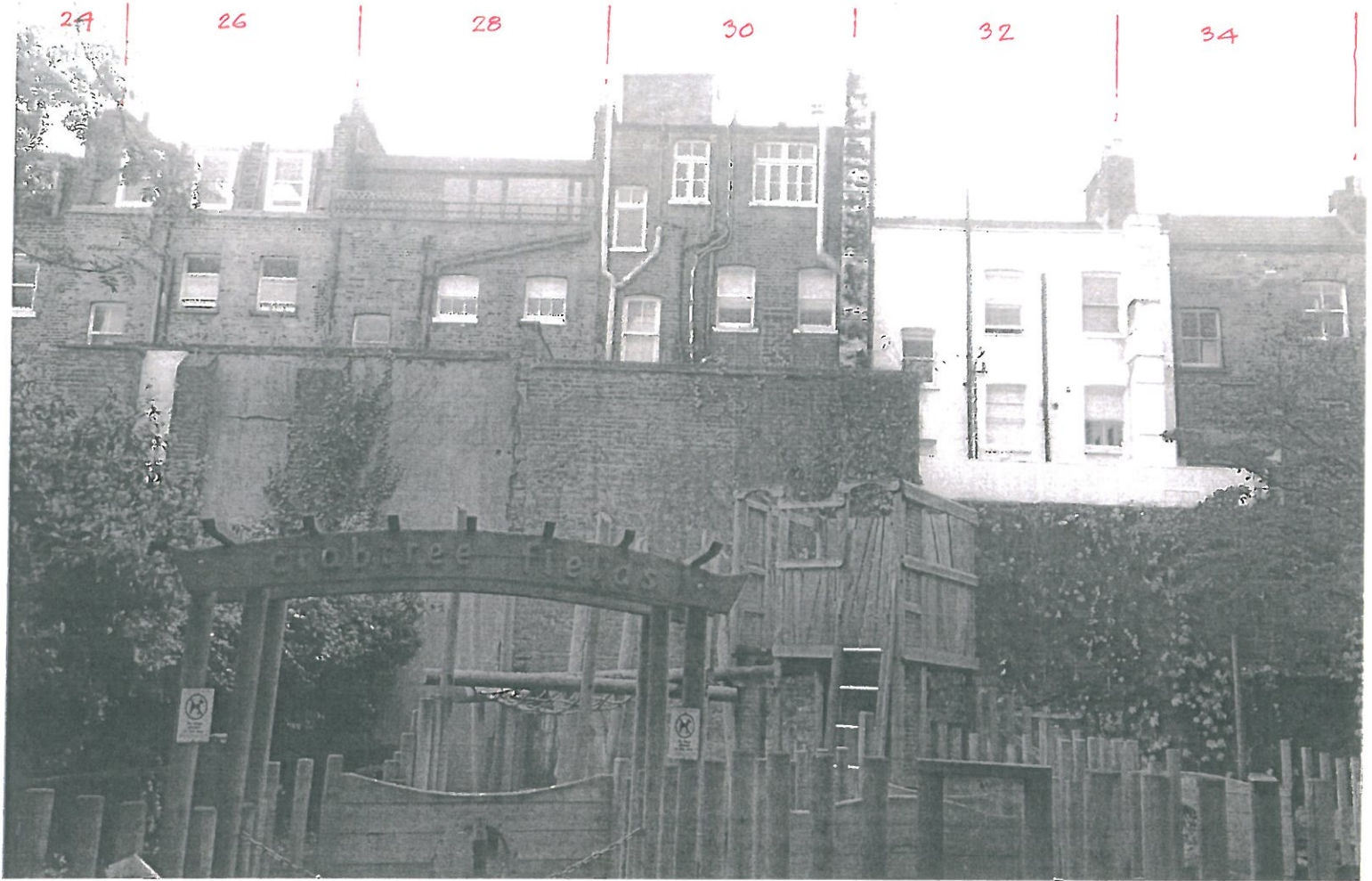
TERRACED UNITS AT CRABTREE PLACE VIEWED FROM THE NORTH