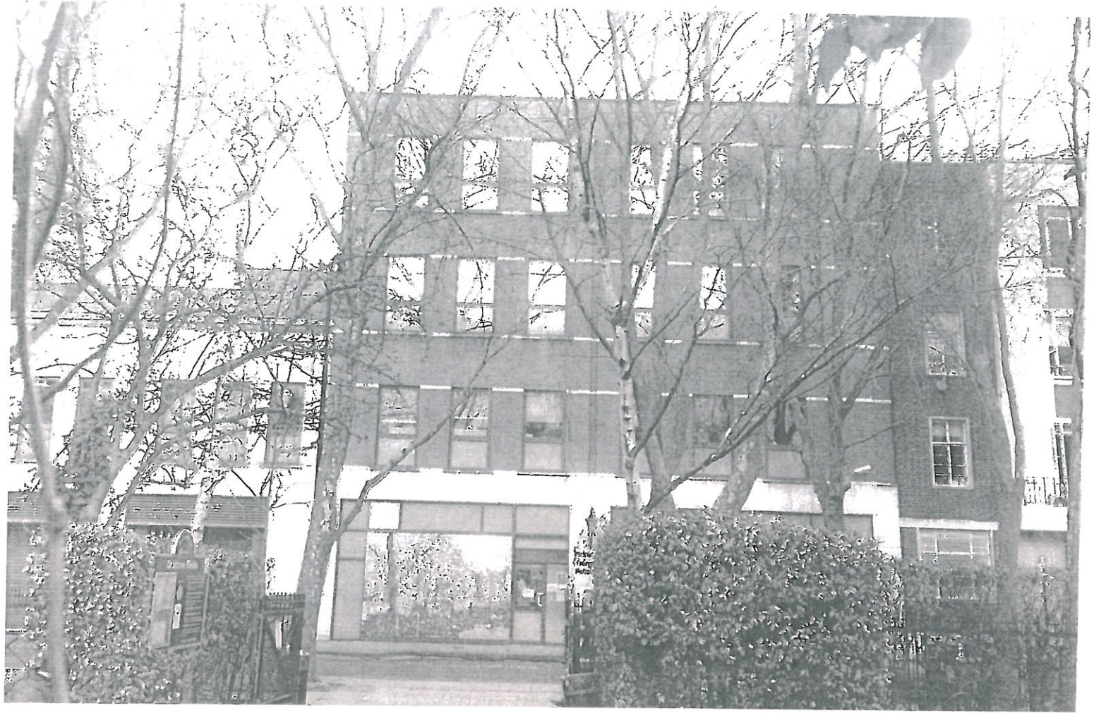
REAR OF 16-18 COLVILLE PLACE OVERLOOKING THE PLAYGROUND