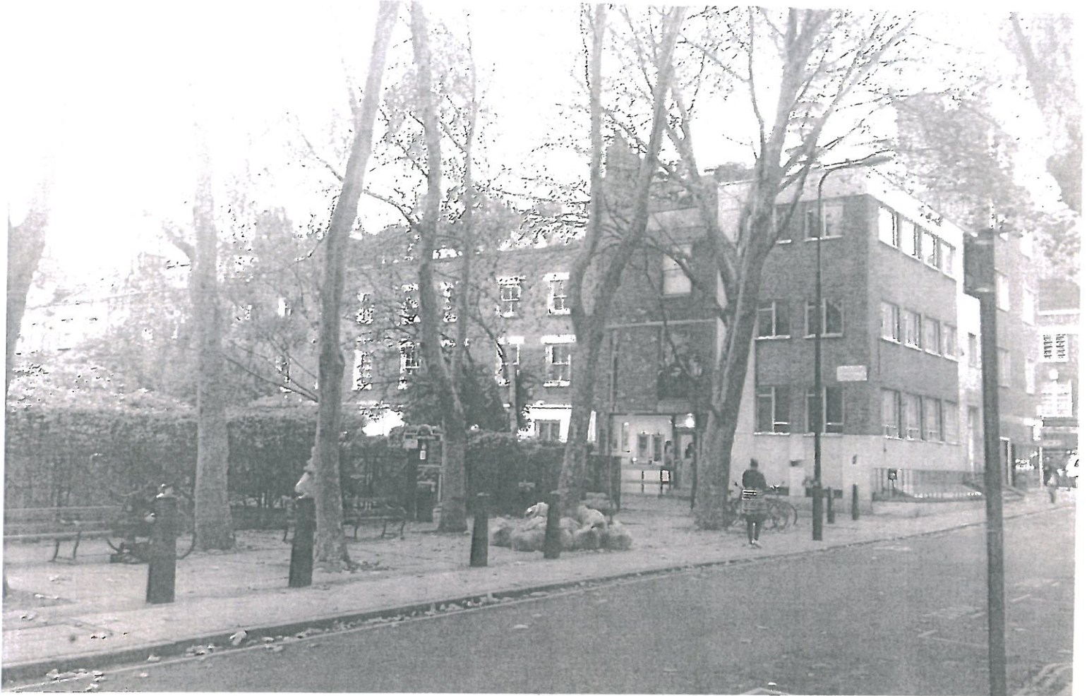
COLVILLE PLACE FRONTAGE OVERLOOKING CRABTREE FIELDS