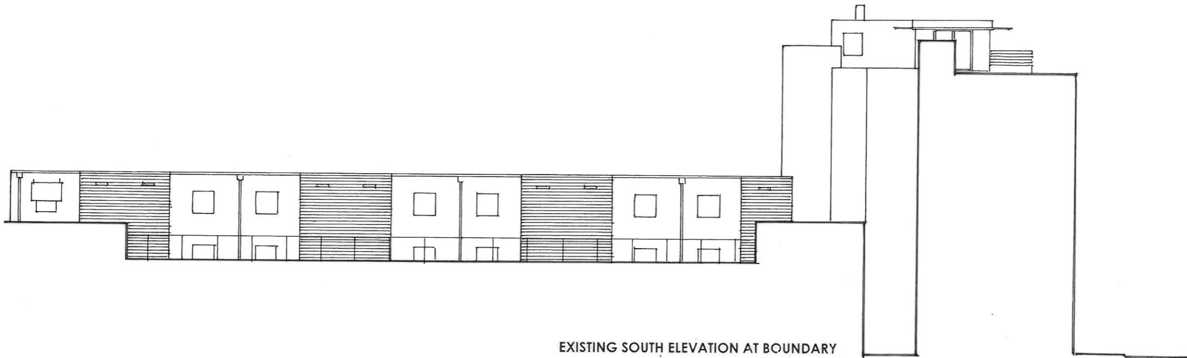
EXISTING SOUTH ELEVATION AT BOUNDARY