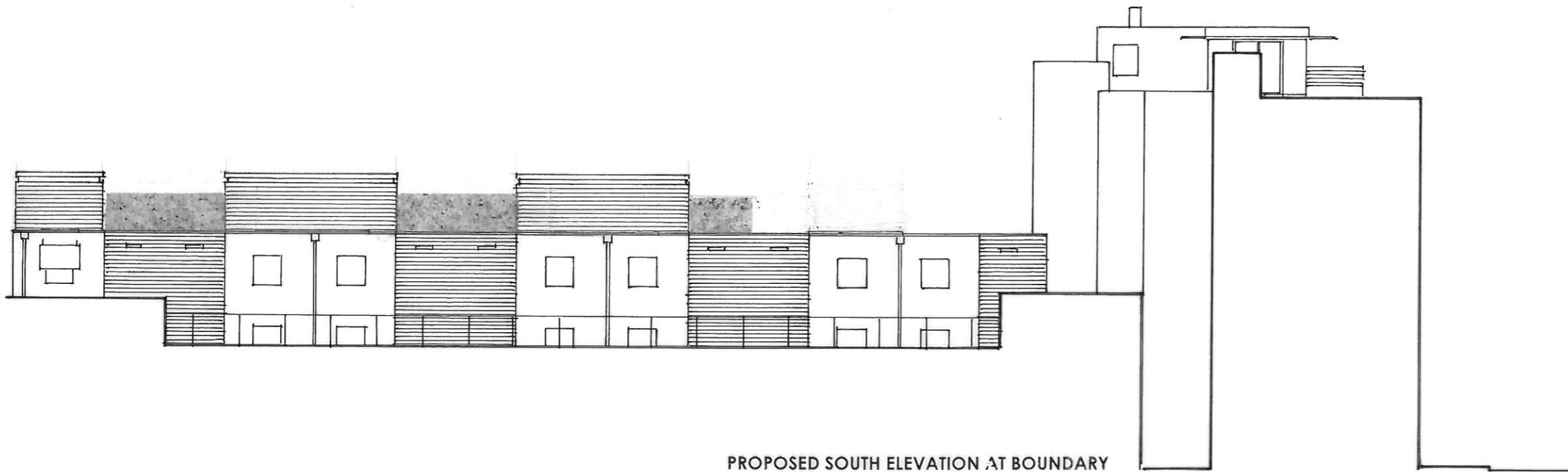
PROPOSED SOUTH ELEVATION AT BOUNDARY