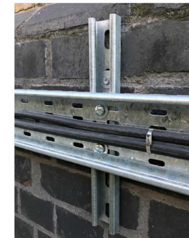
Wall mounted electrical containment (all fixings through mortar joints)