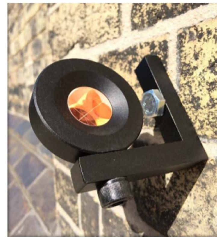
Wall / truss mounted prism (all wall fixings through mortar joints)