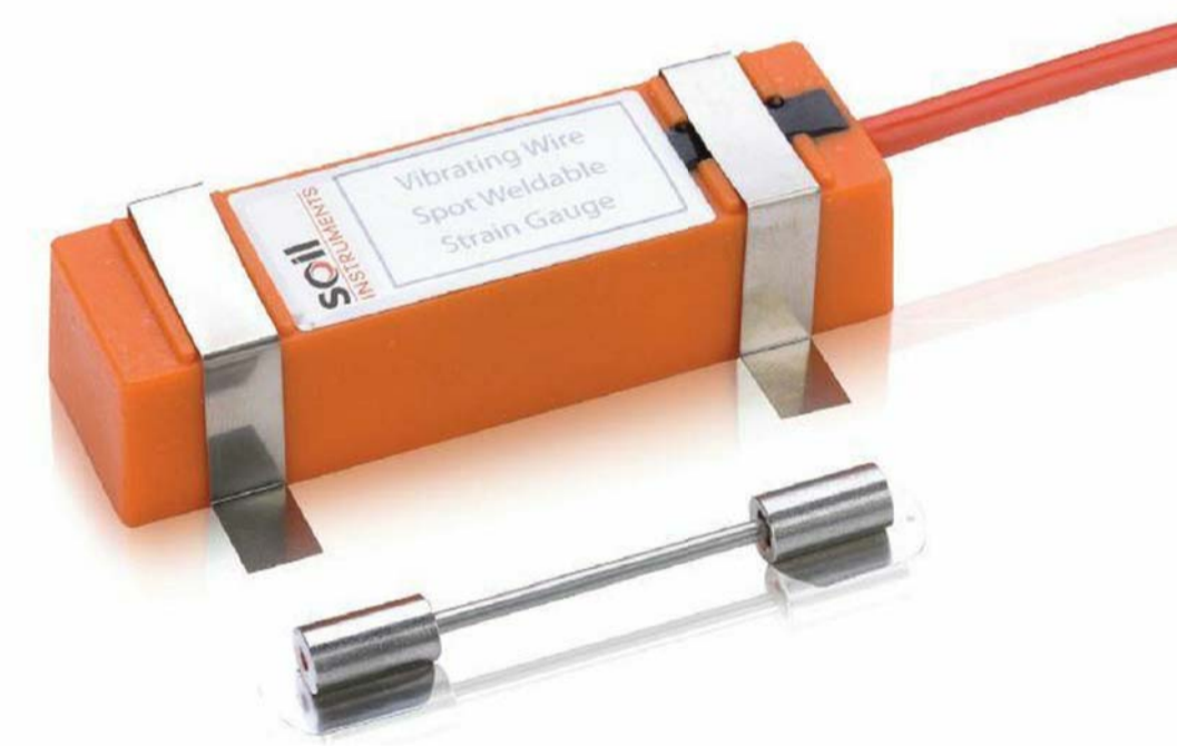
Strain gauge (Truss mounted)