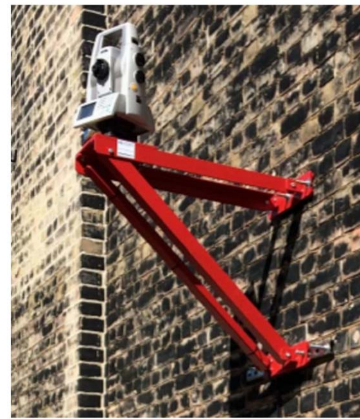
Wall mounted total station