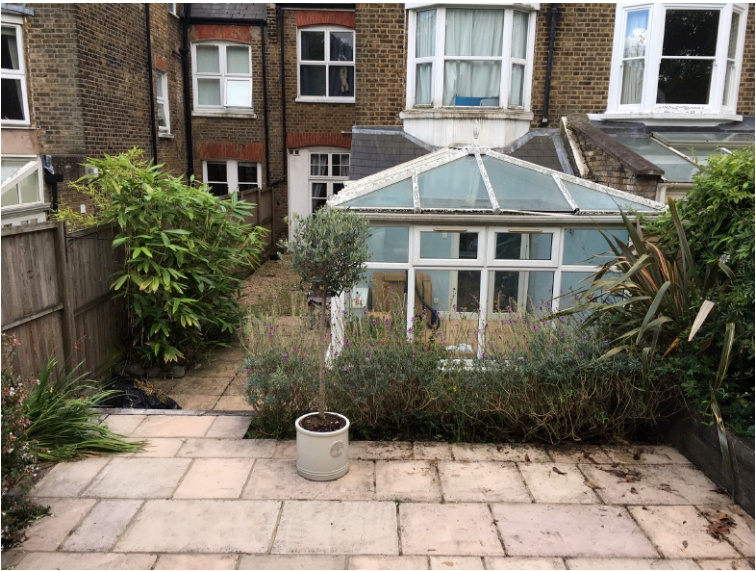
Rear Conservatory & Garden

The Studio 320 Kilburn Lane London W9 3EF +44 (0)20 8968 5232 info@studiomcleod.com