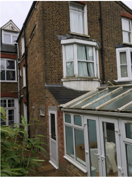
Rear Side Return