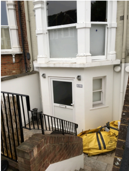
45 Hillfield Road Basement (Neighbouring Property)