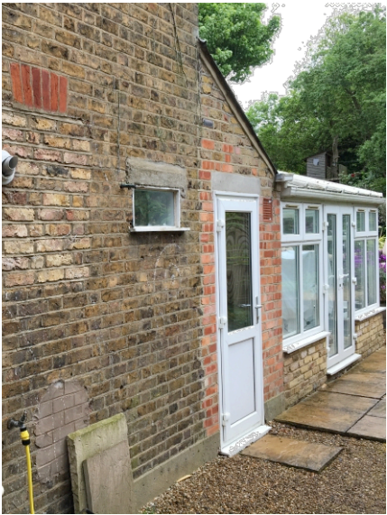
Rear Closet Wing, Porch and Conservatory