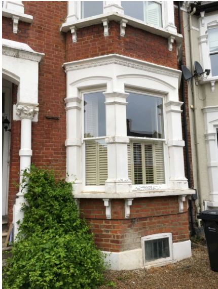
GF and LGF Front Elevation