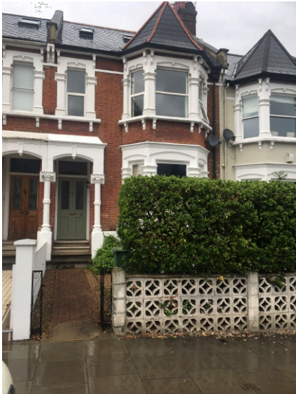
Front Elevation and Access