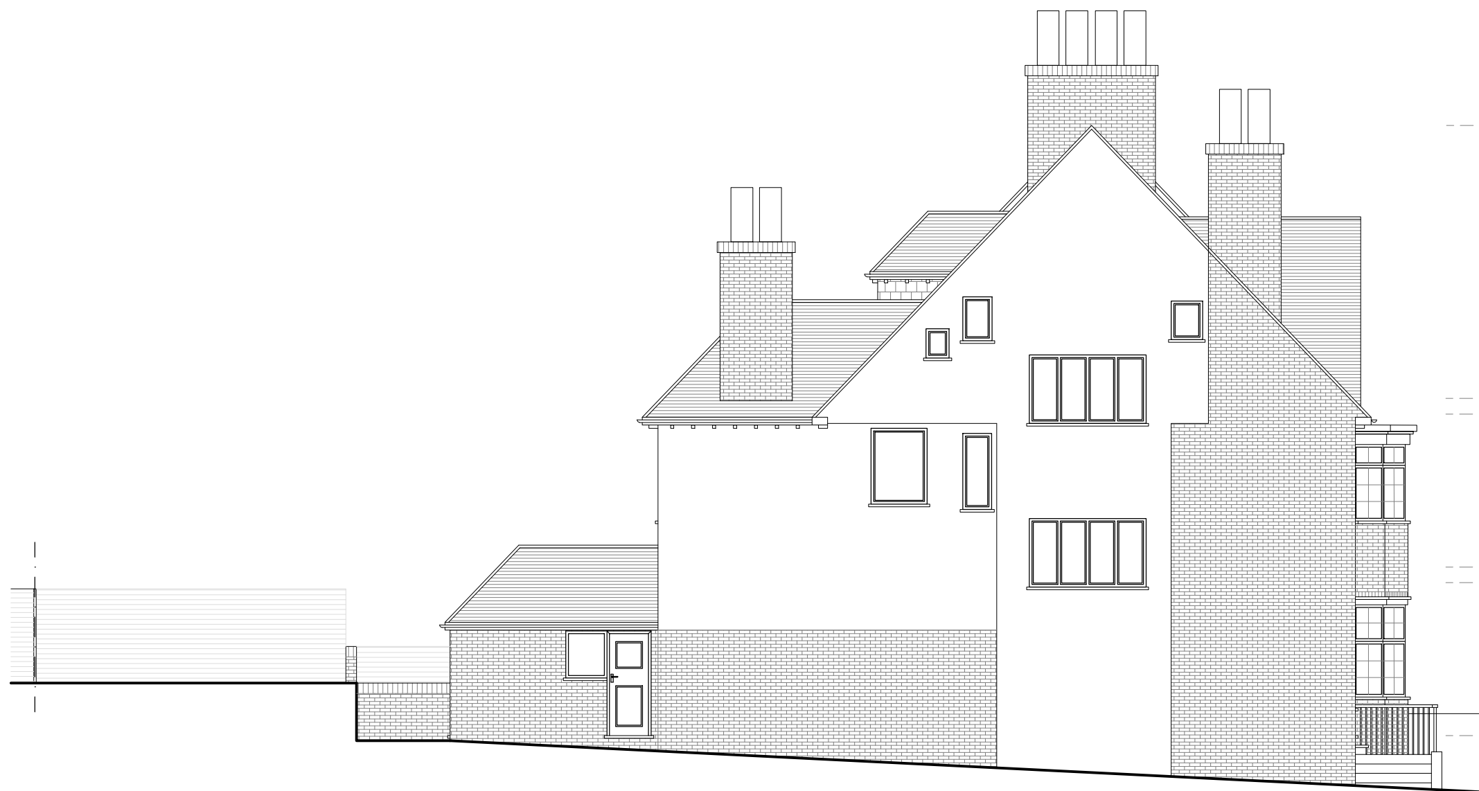
EXISTING SOUTH SIDE ELEVATION