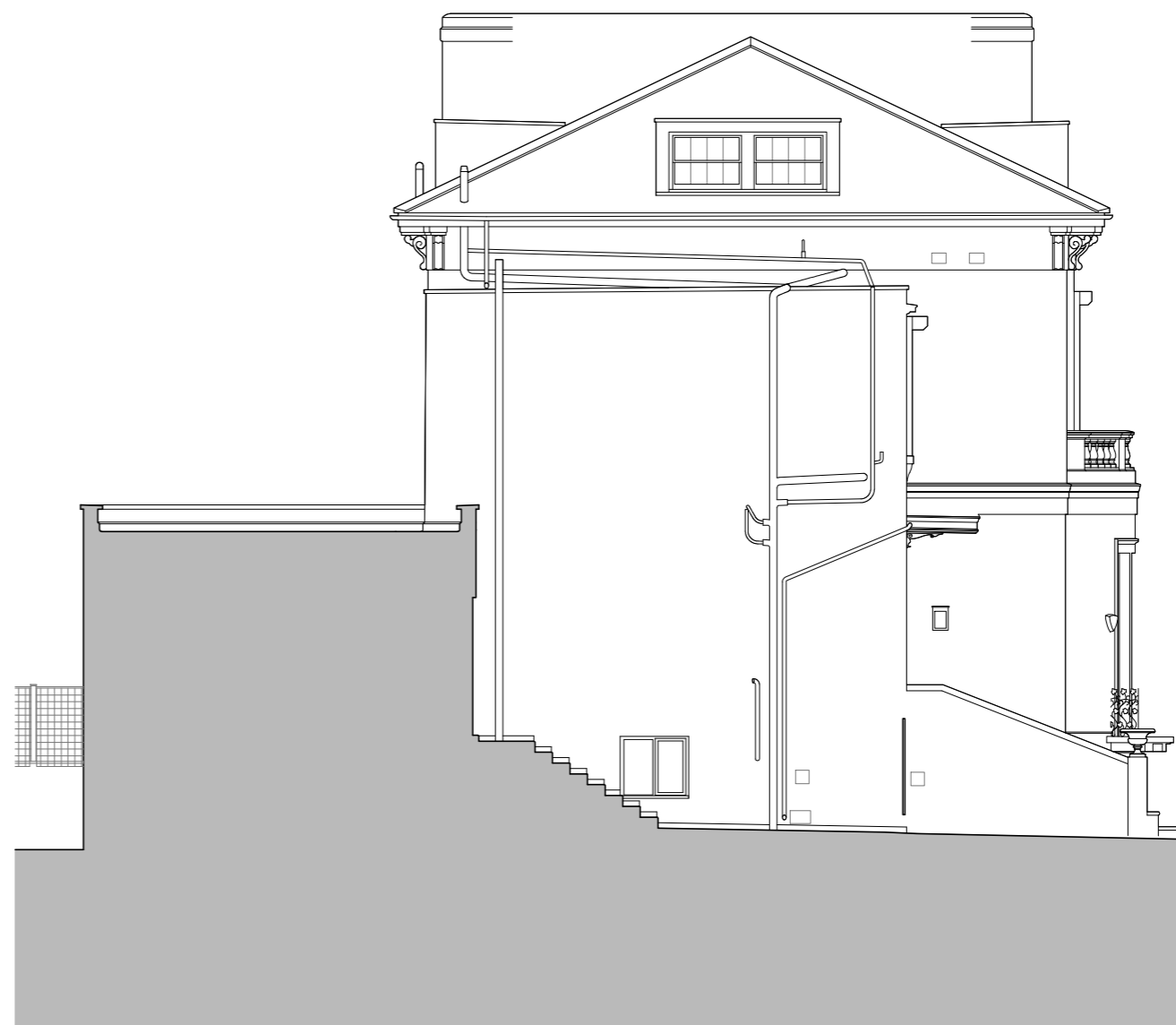
ELEVATION FLANK (SW) - SECTION THROUGH EXISTING KITCHEN 1:100