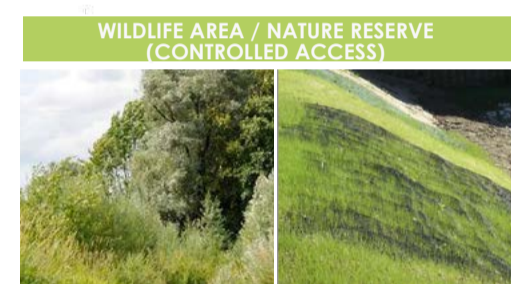
WILDLIFE AREA / NATURE RESERVE (CONTROLLED ACCESS) Erosion control blanket required to stabilise soil on 1:3 slope

PRIVATE REAR GARDENS FOR SURROUNDING PROPERTIES