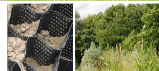
WILDLIFE AREA / NATURE RESERVE (CONTROLLED ACCESS) Stabilisation system required to stabilise & reinforce soil on 1:2.3 slope (23 degrees)