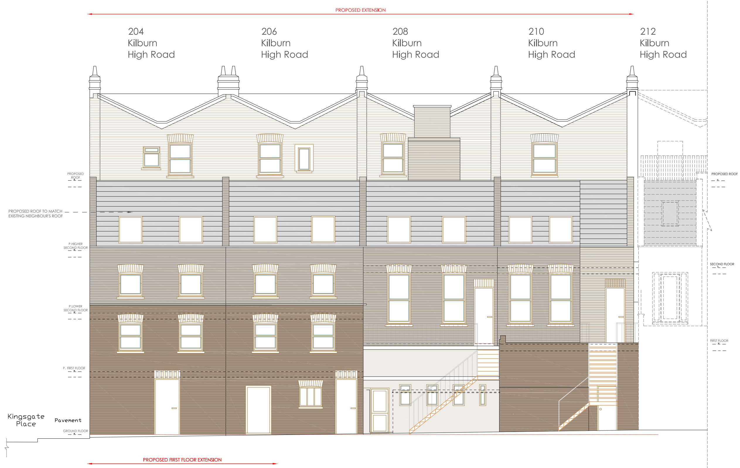
ELE PROPOSED REAR ELEVATION Scale: A3 1:100 - A1 1:50