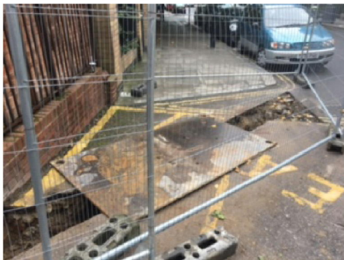
Subject :Deliveroo working on creating 9 Kitchens behind my home in Cresta House Car Park - Swiss Cottage