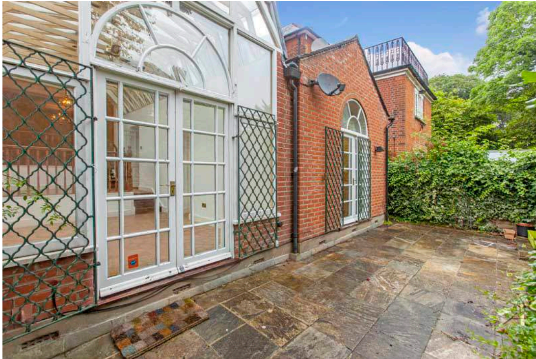
existing rear view of property