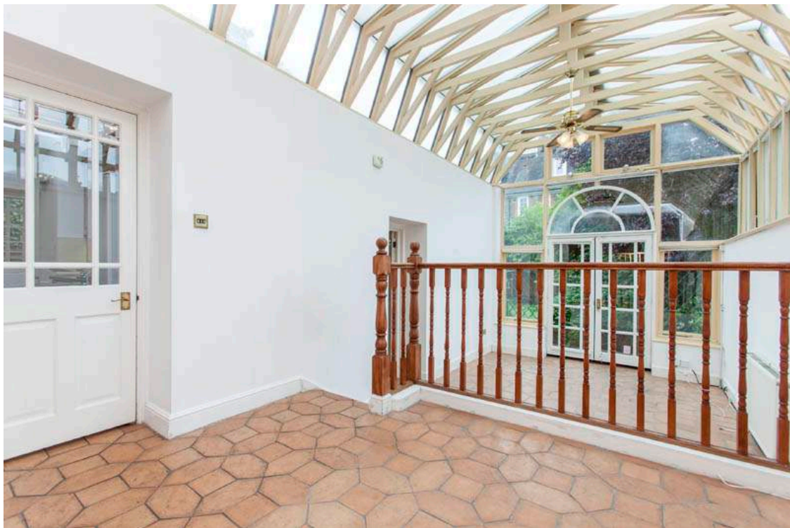
existing internal view of the conservatory