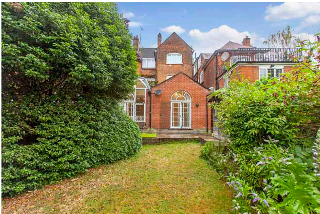
existing rear view of property