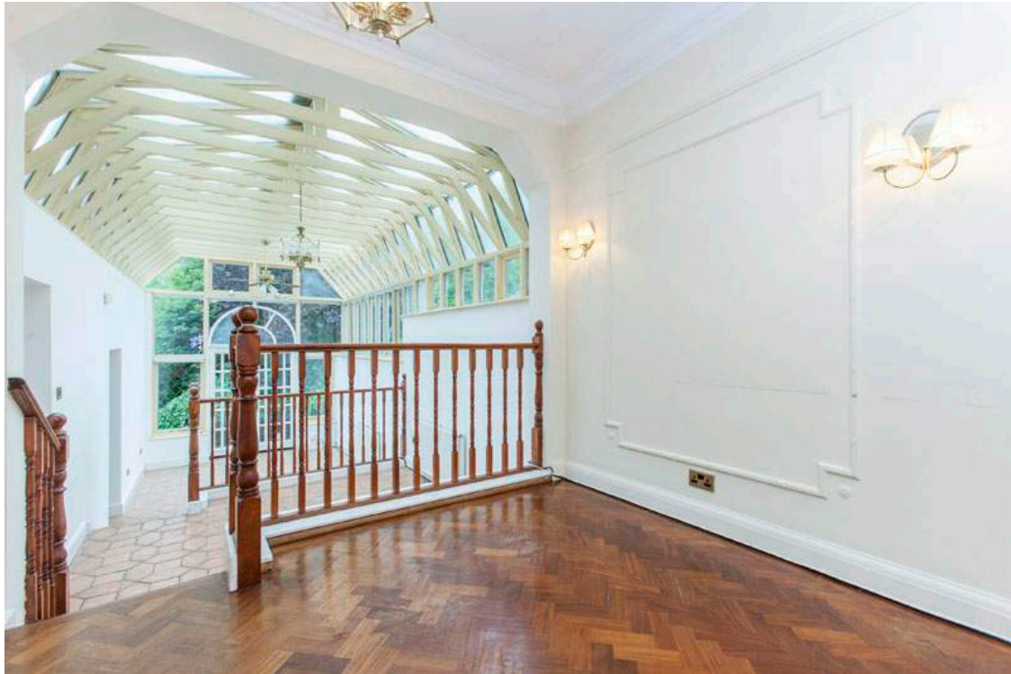
existing internal view of the conservatory