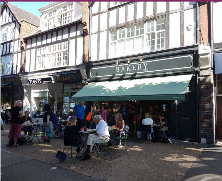
Figure 1: View of the Unit from Swain's Lane