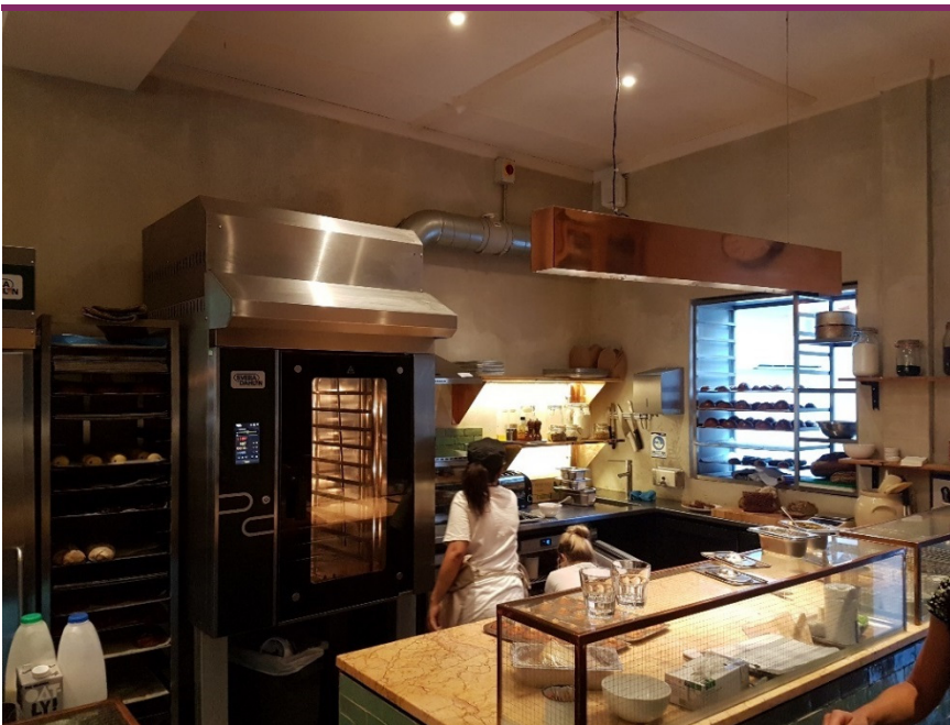
F.2: Internal View of the Kitchen Equipment (As Existing)