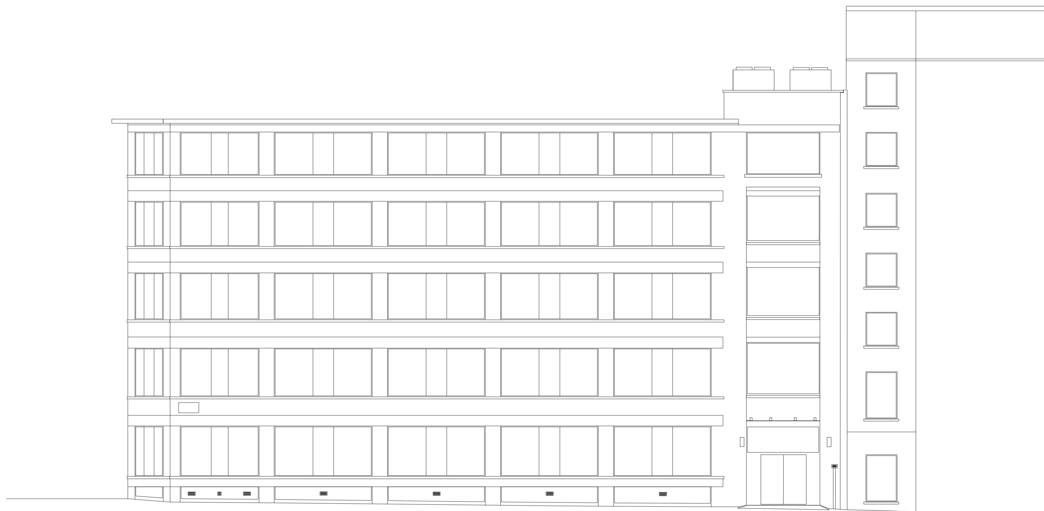
PROPOSED DRUMMOND STREET ELEVATION

NEW LOUVERS ON 1st & 3rd FLOOR TO MATCH EXISTING