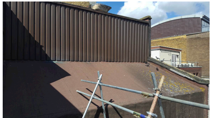
Pigeons on the roof