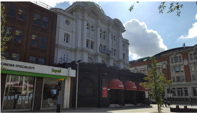
Western façade of the building