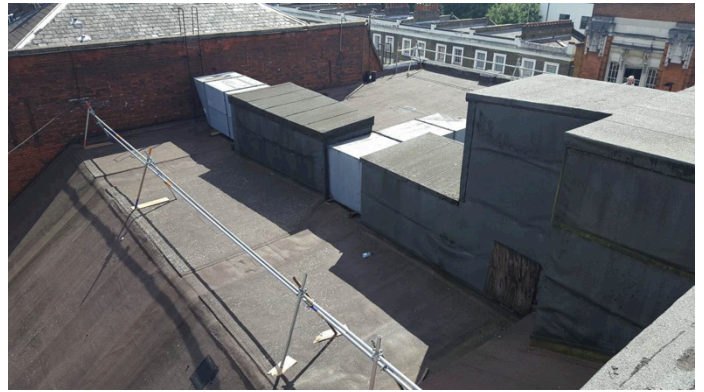
Flat asphalt roof in good condition