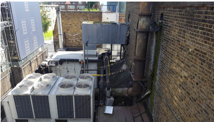
Service pipes with pigeon deterrents