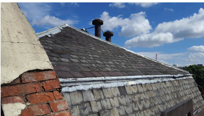
Slate tiled roof in good condition