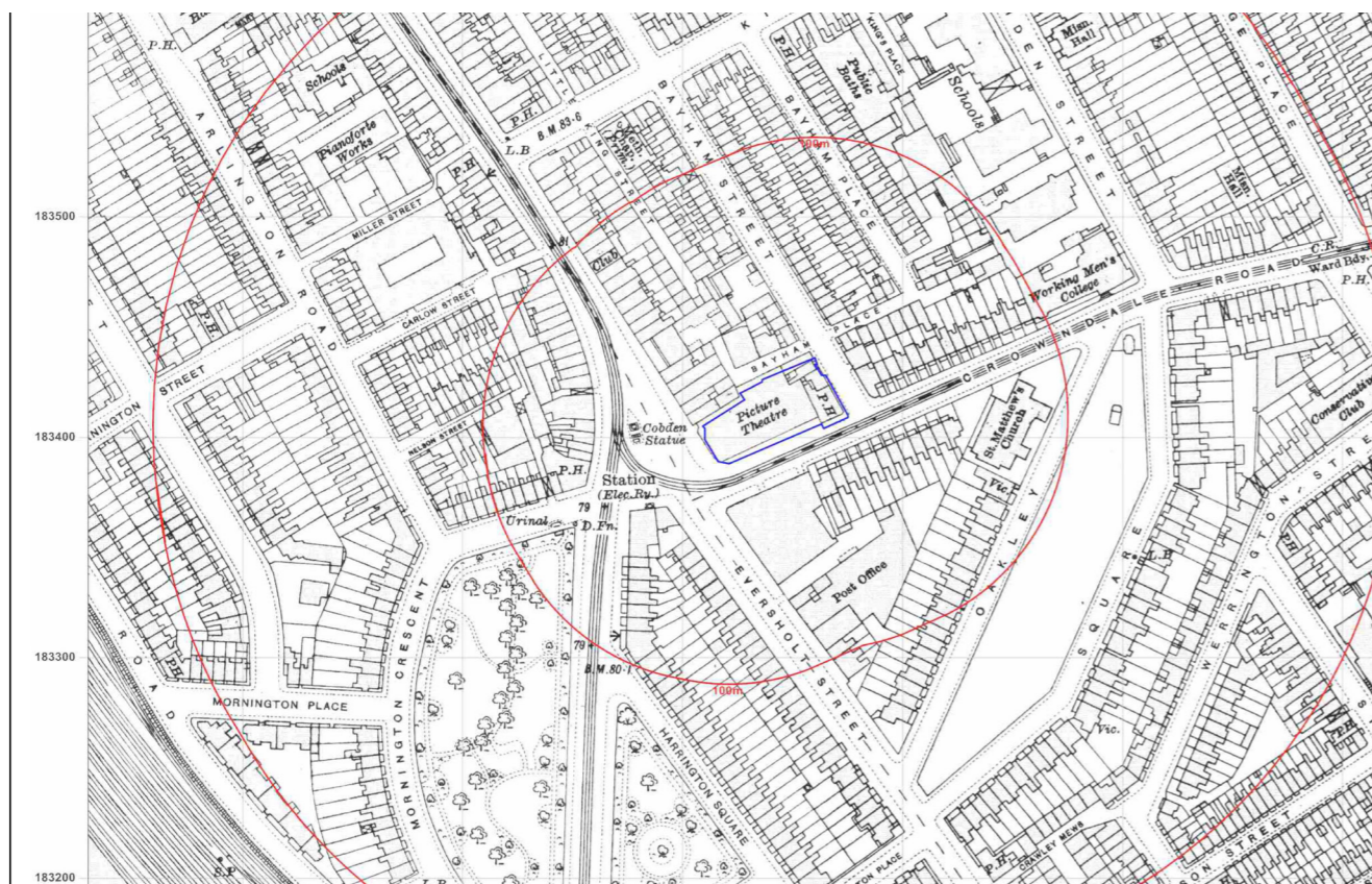
Archive map - 1916