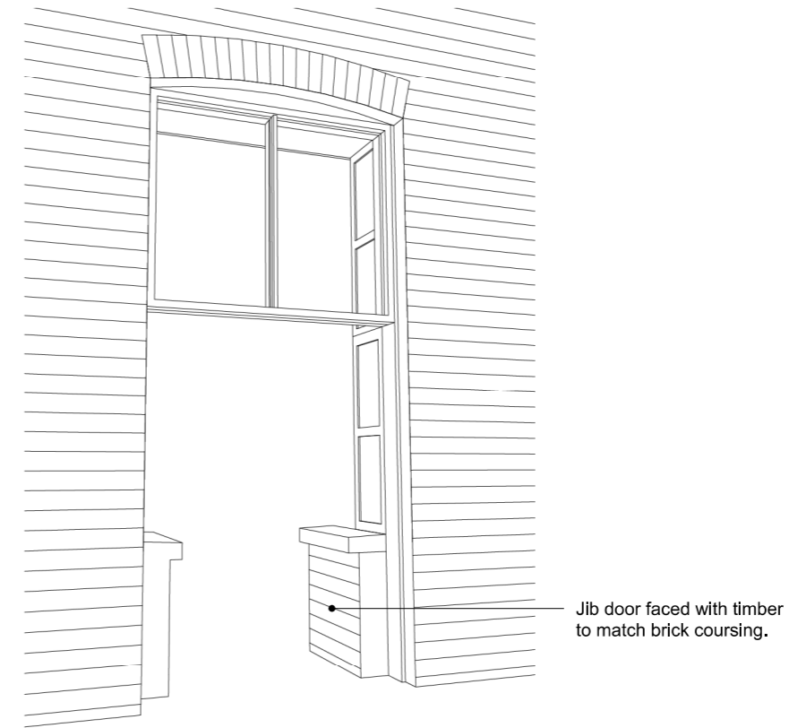
Proposed Jib Door View from R0-4 Kitchen/Dining

Any discrepancies should be reported immediately to the architect If in doubt ask. This drawing is copyright of the Architect.