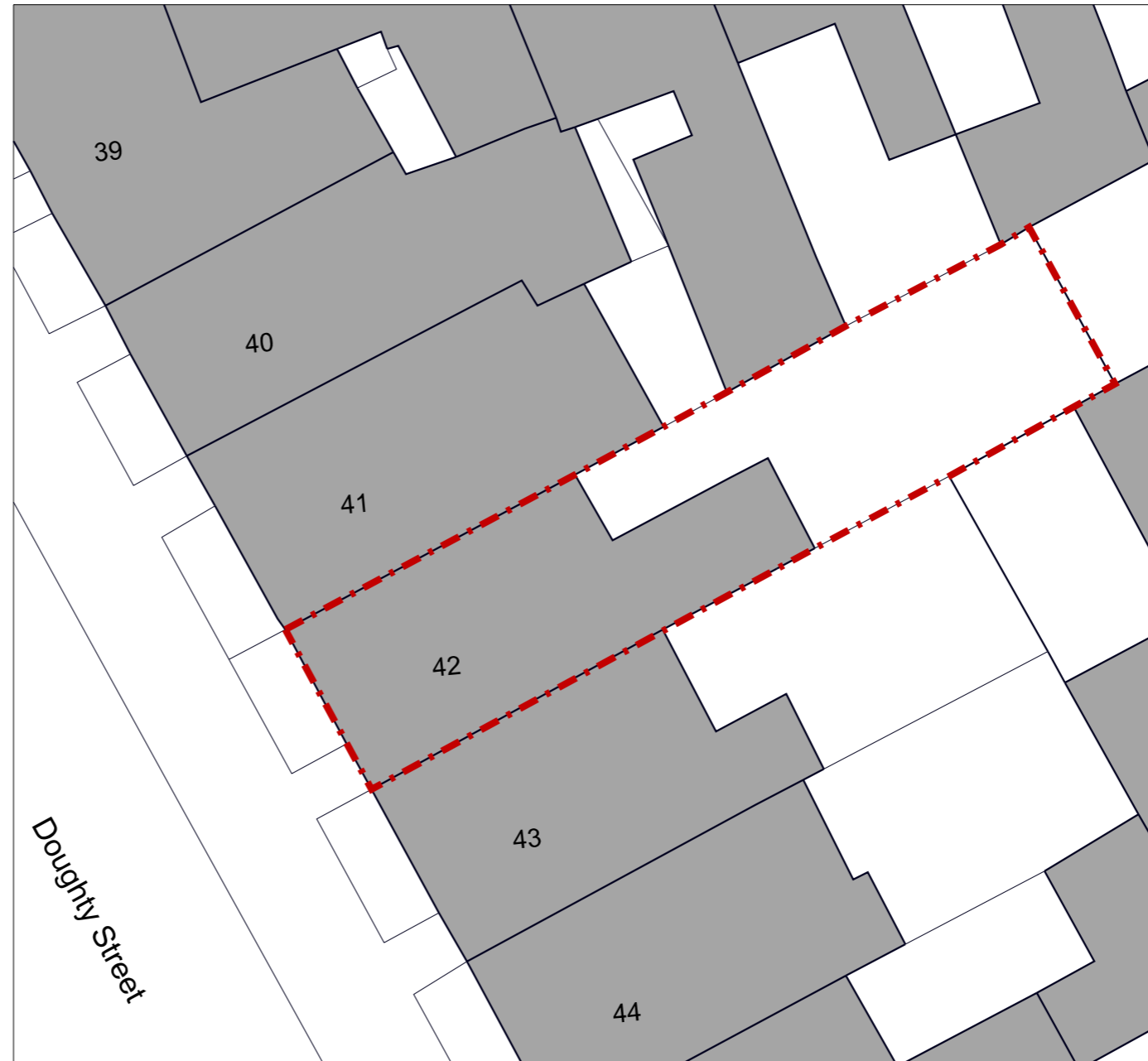
Block plan as existing 1:200@A3