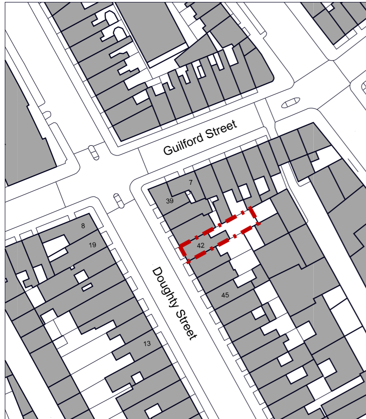
Location plan 1:1250@A3