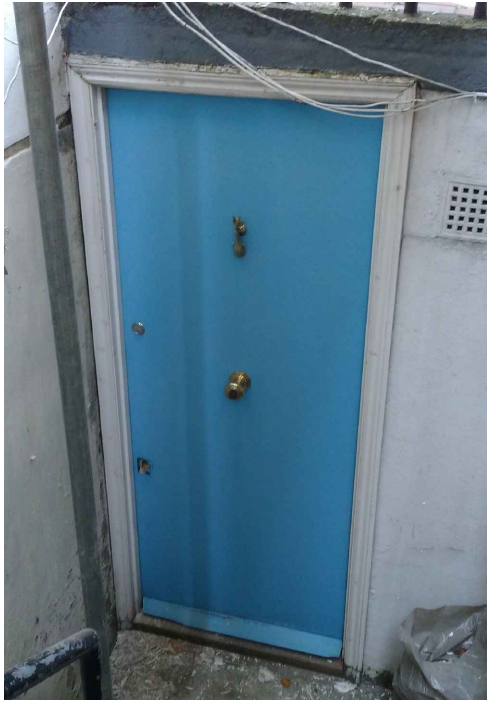
EXISTING TIMBER DOOR