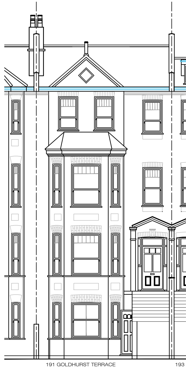
EXISTING FRONT ELEVATION (SCALE 1:100)