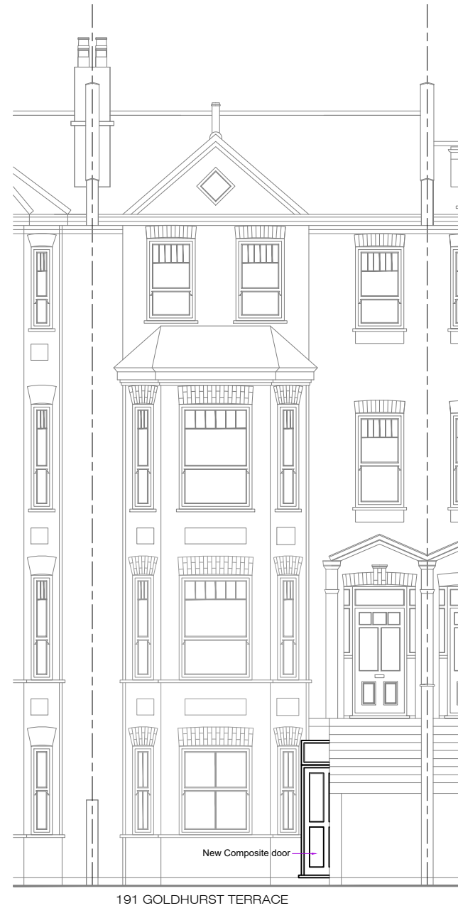
PROPOSED FRONT ELEVATION (SCALE 1:100)