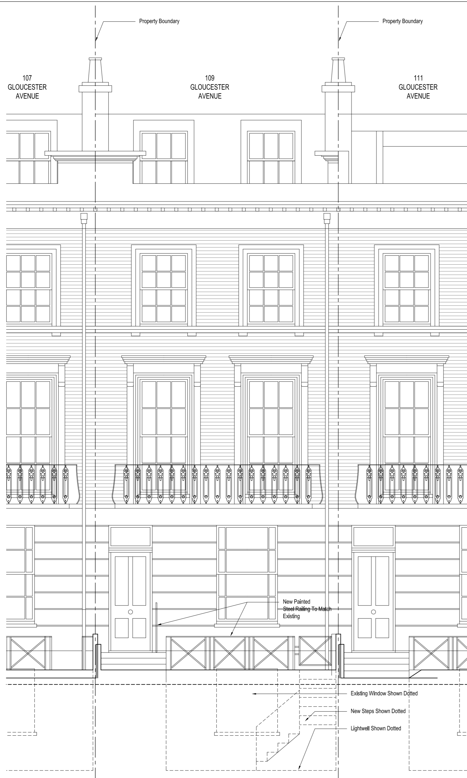
01. FRONT ELEVATION