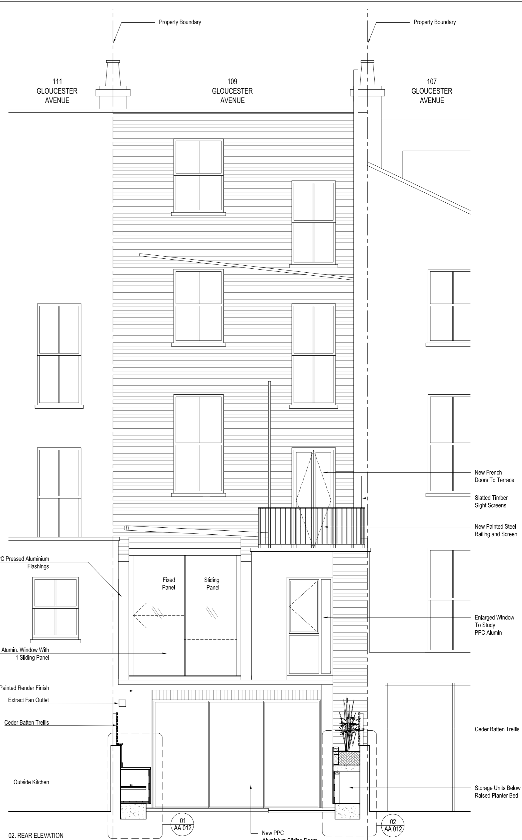
02. REAR ELEVATION