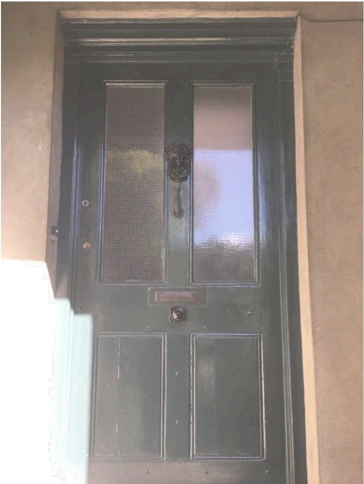
PHOTOGRAPH OF EXISTING FRONT DOOR