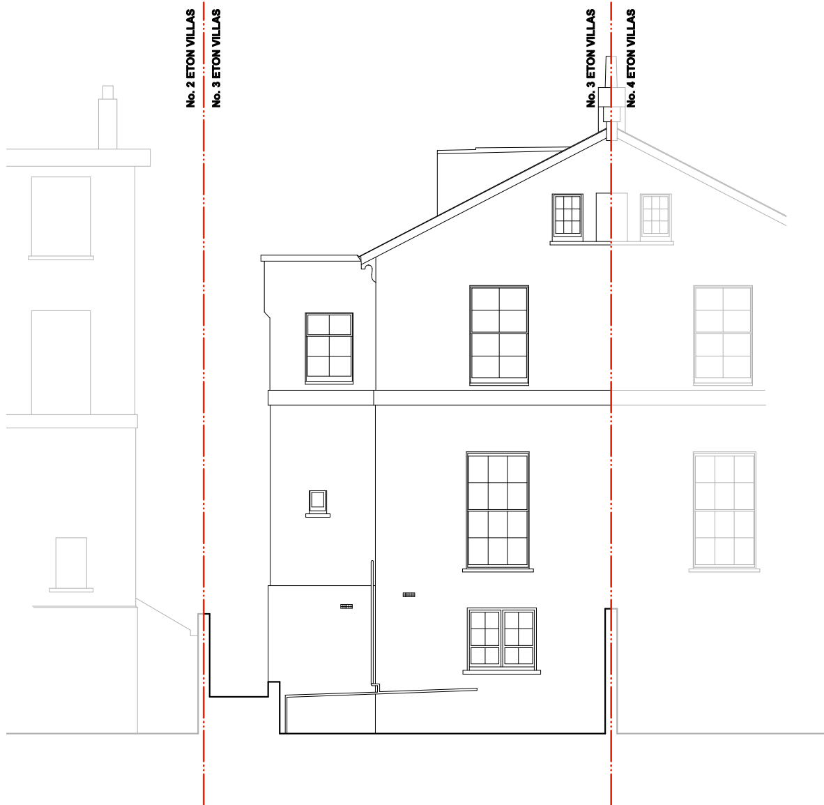
REAR ELEVATION EXISTING