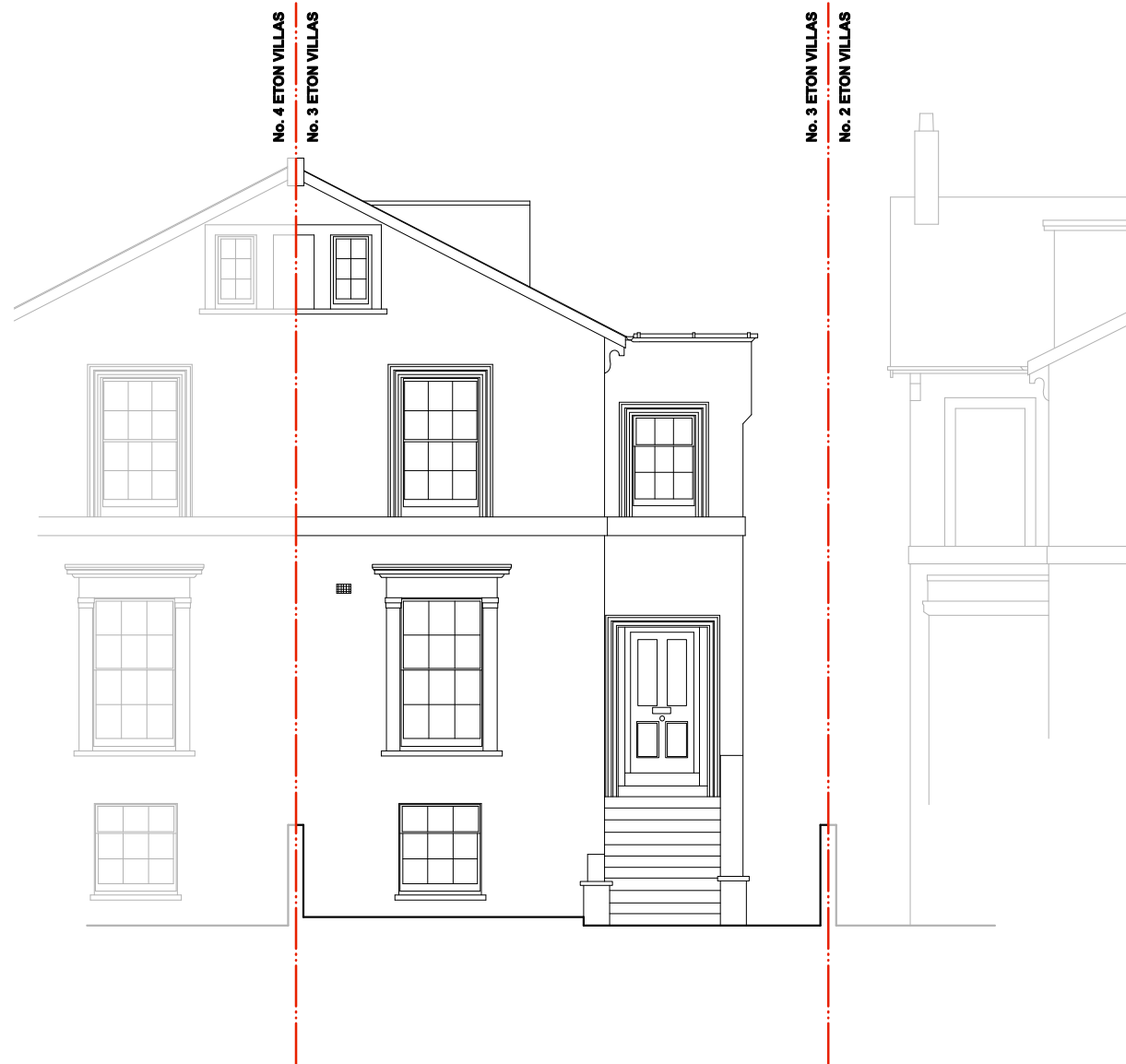
FRONT ELEVATION EXISTING