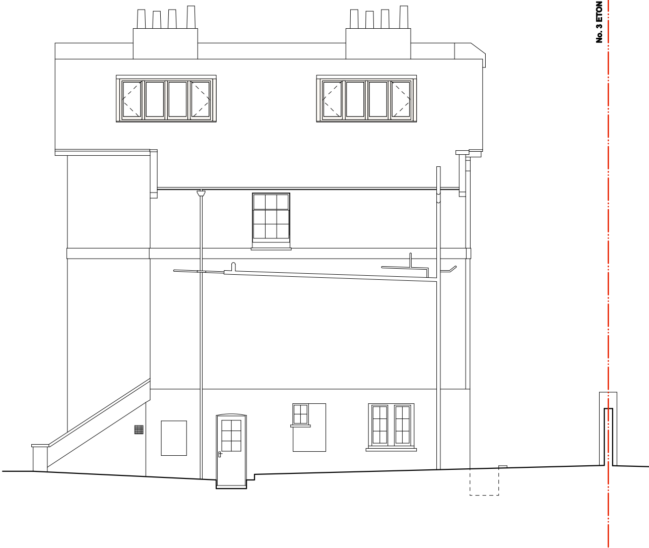
SIDE ELEVATION EXISTING