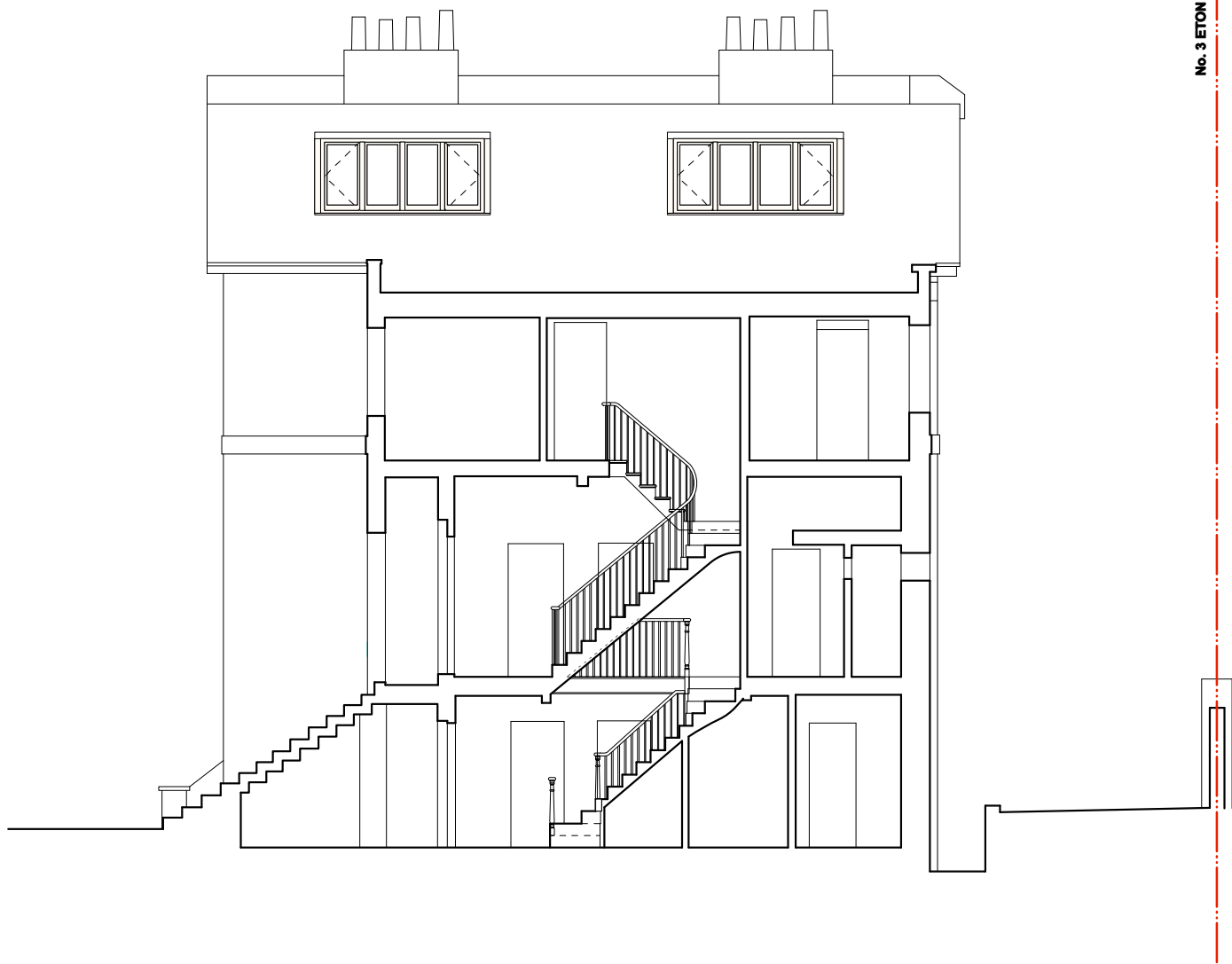
SECTION AA EXISTING