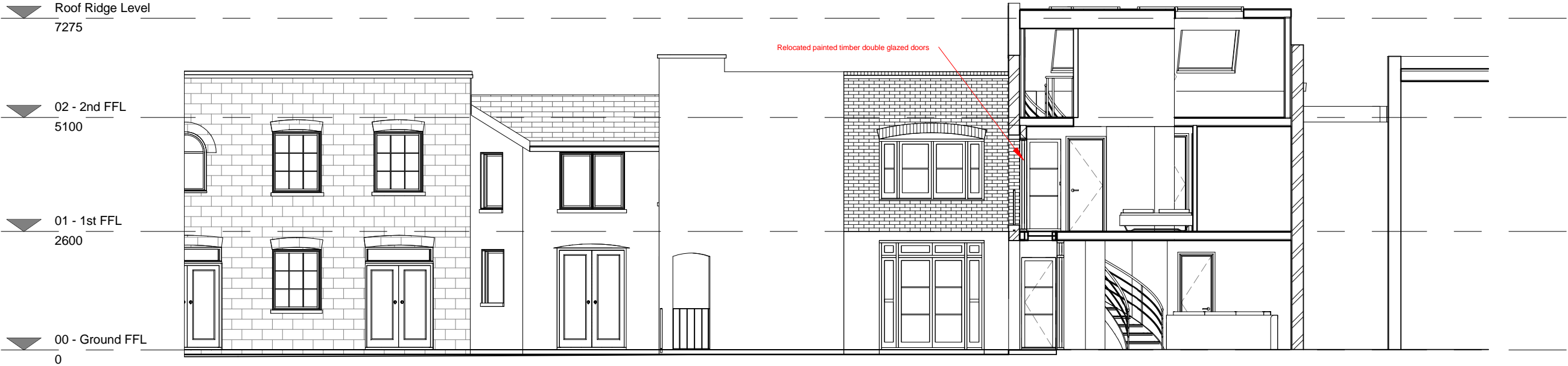
SIDE (WEST) ELEVATION AND SECTION 1:100

DO NOT SCALE FROM THIS DRAWING. ALL DIMENSION TO BE CHECKED ON SITE. COPYRIGHT RESERVED