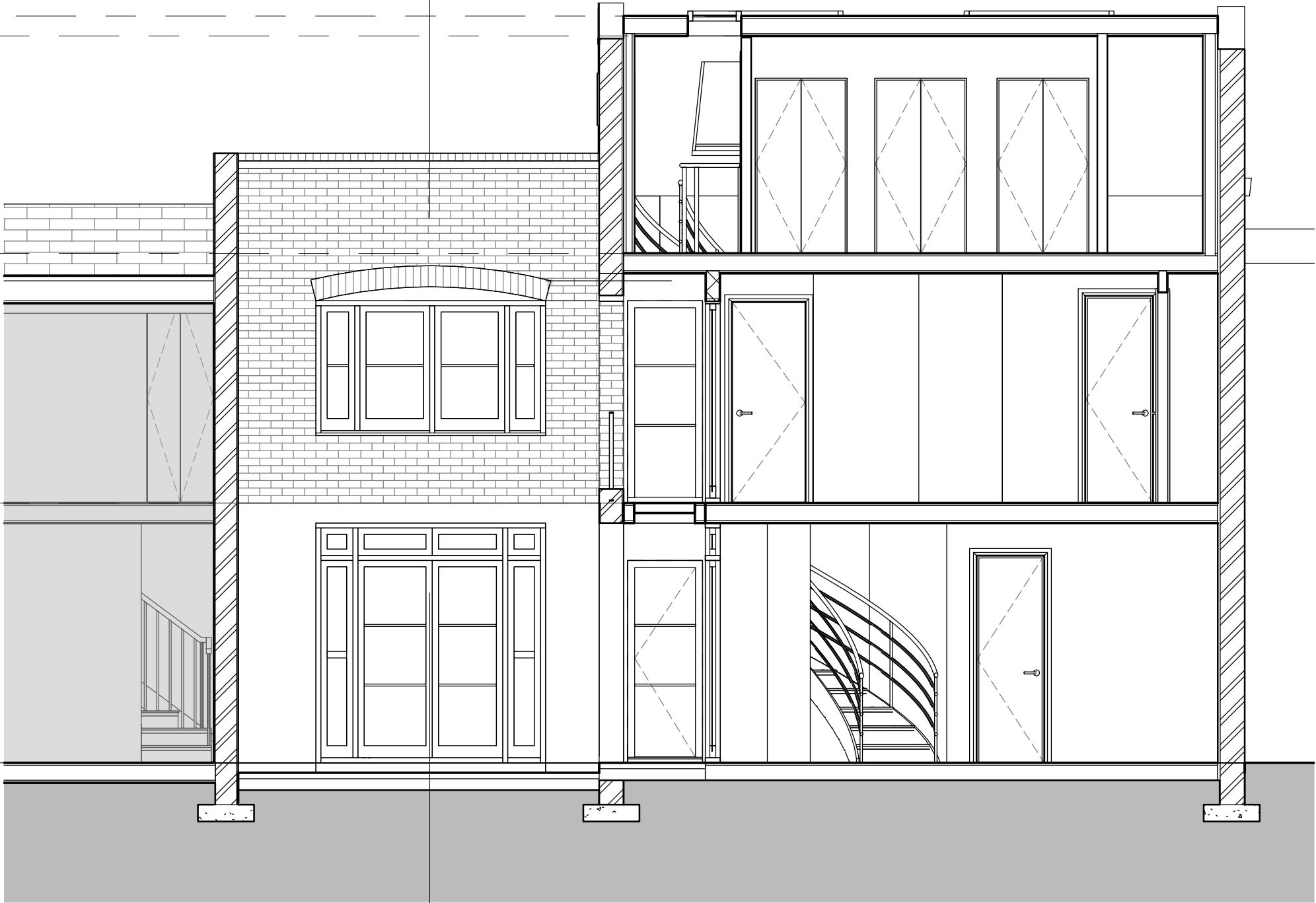
SECTION CC 1:50