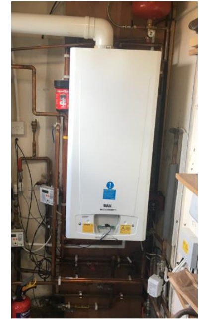
⑪ anaerobic digester system to be removed to be reused at another site (micro combined heat & power unit)