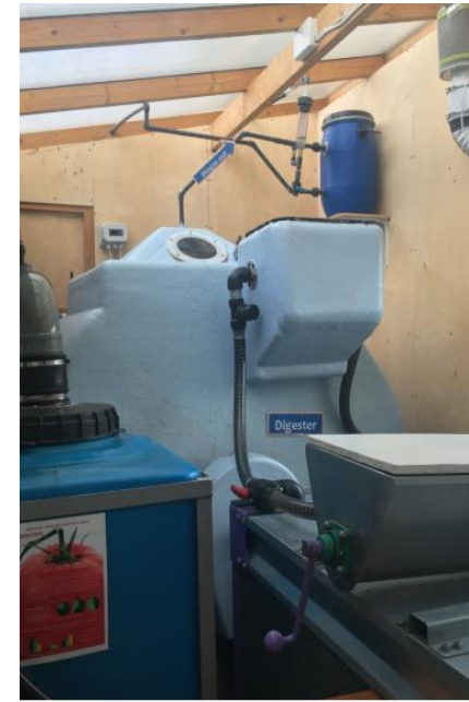
⑩ anaerobic digester system to be removed to be reused at another site (main digester and associated plant)