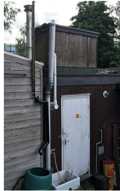
⑧ existing boiler room showing flues, water recycling and roof mounted water storage tank to be demolished