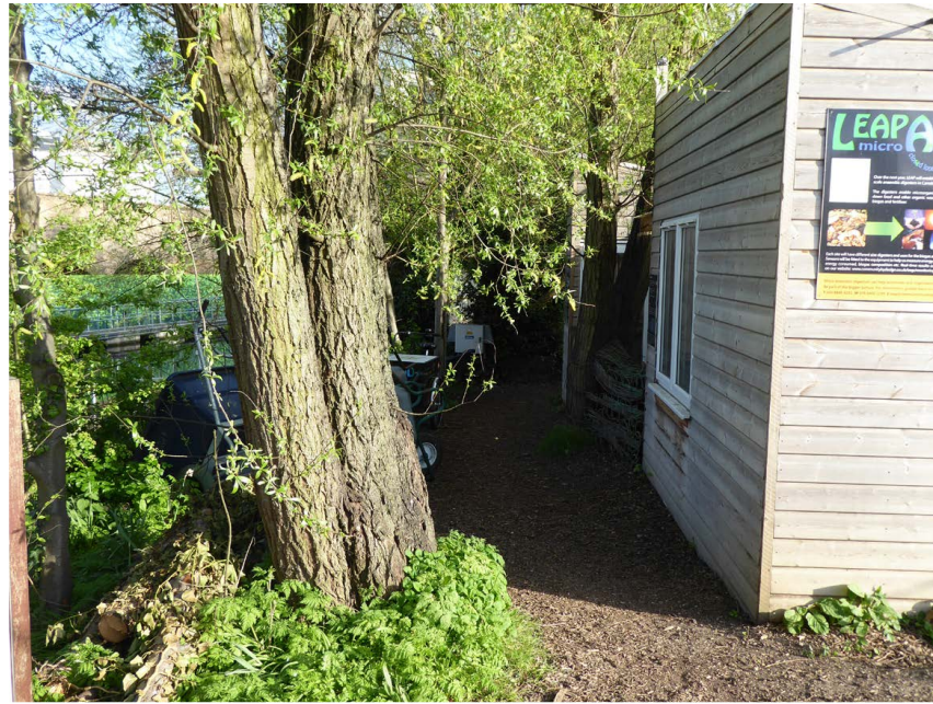
⑦ view of corner of existing building containing anaerobic digester to be demolished and existing willow tree to be removed