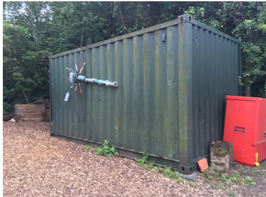
⑫ existing storage container to be relocated