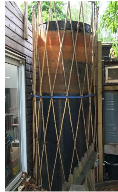
⑨ anaerobic digester system to be removed to be reused at another site (biogas storage tank)