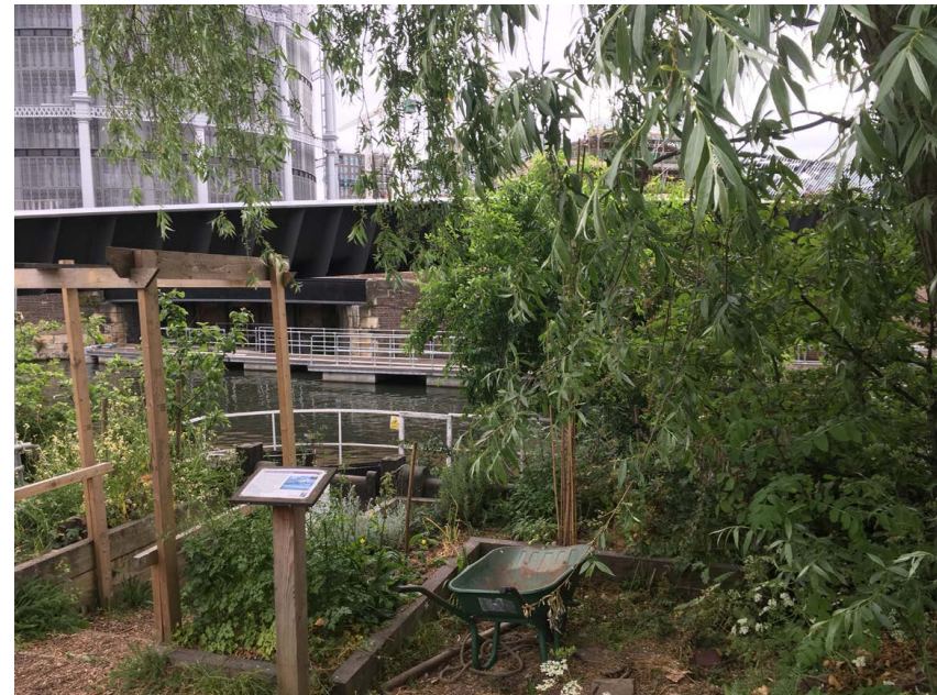
⑬ existing flowerbed to be retained, timber canopy to be demolished, area to left of canopy to be demolished to for installing new timber tiered decking