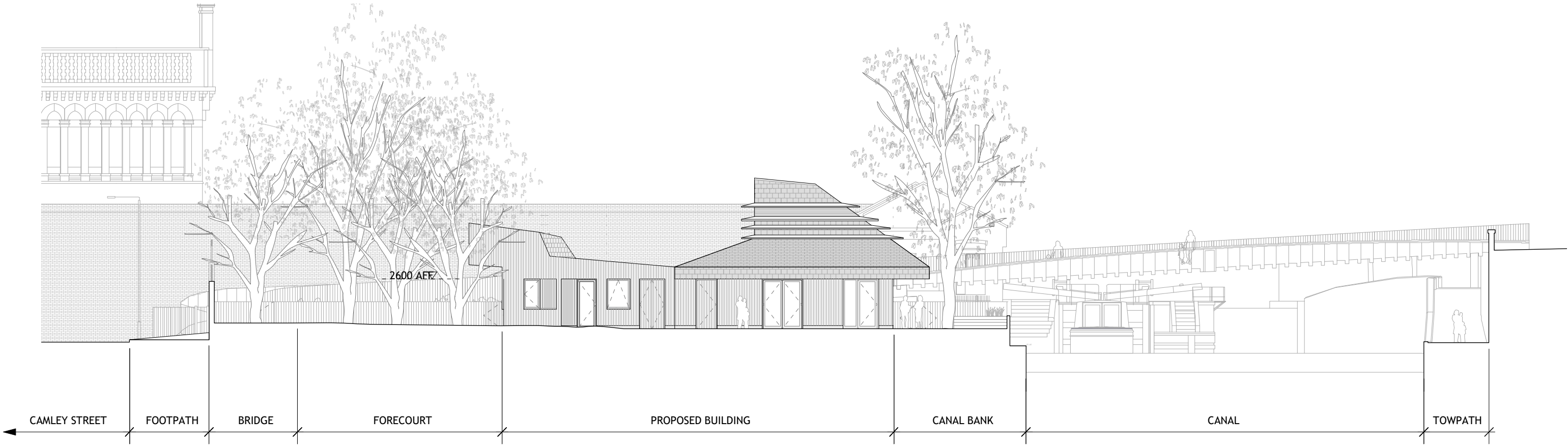
01 Elevation South 1:100