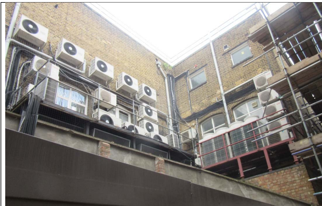
South Elevation July 2016

(taken at ground level from adjoining owner's site)