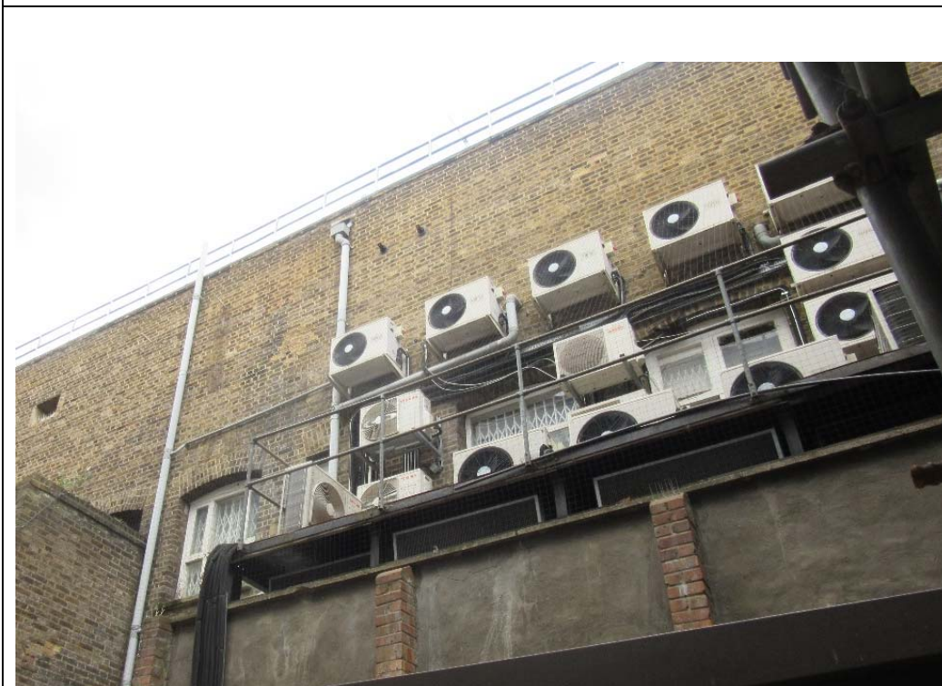
South Elevation July 2016

(taken at ground level from adjoining owner's site)