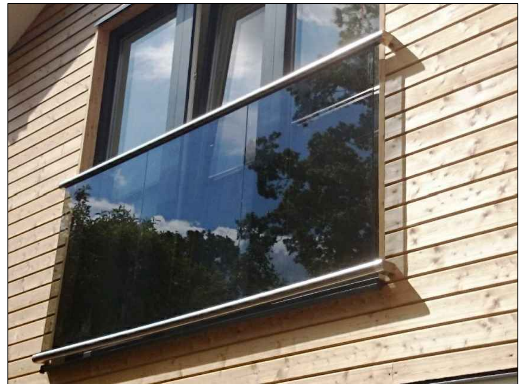
Rear Elevation Rear Juliette Balcony (Glazing across opening)

A1 Original Sheet Size Actual Size 50mm 75mm 90mm