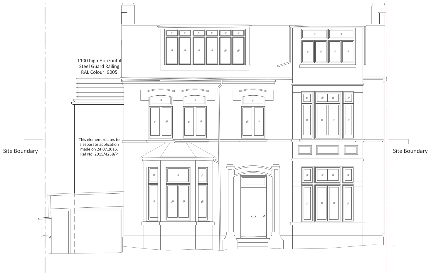
PROPOSED FRONT ELEVATION (AS EXISTING) - 1:100@A3