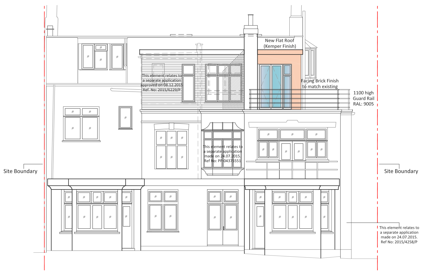
PROPOSED REAR ELEVATION - 1:100@A3