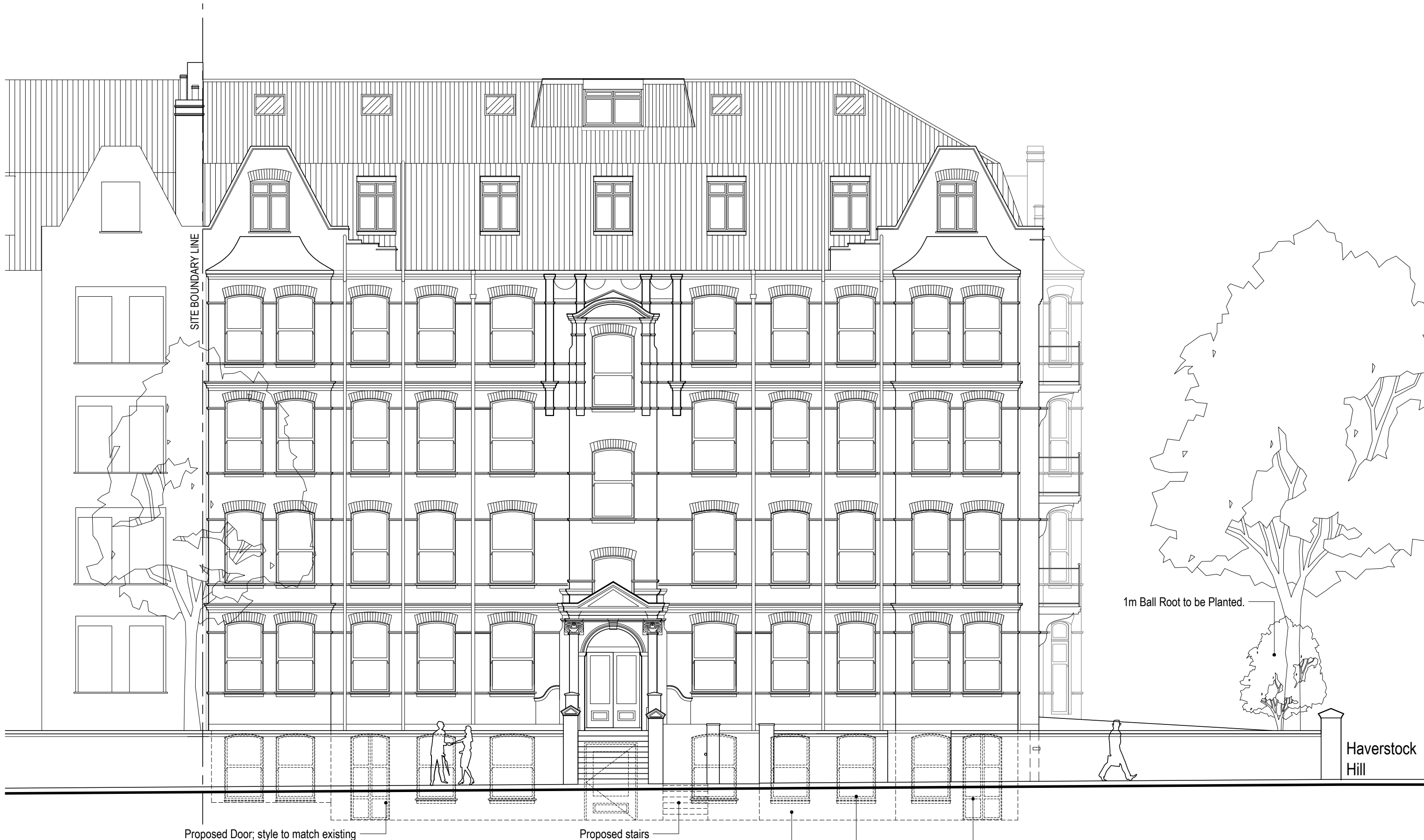
Proposed Front Elevation Scale 1:100 @ A3