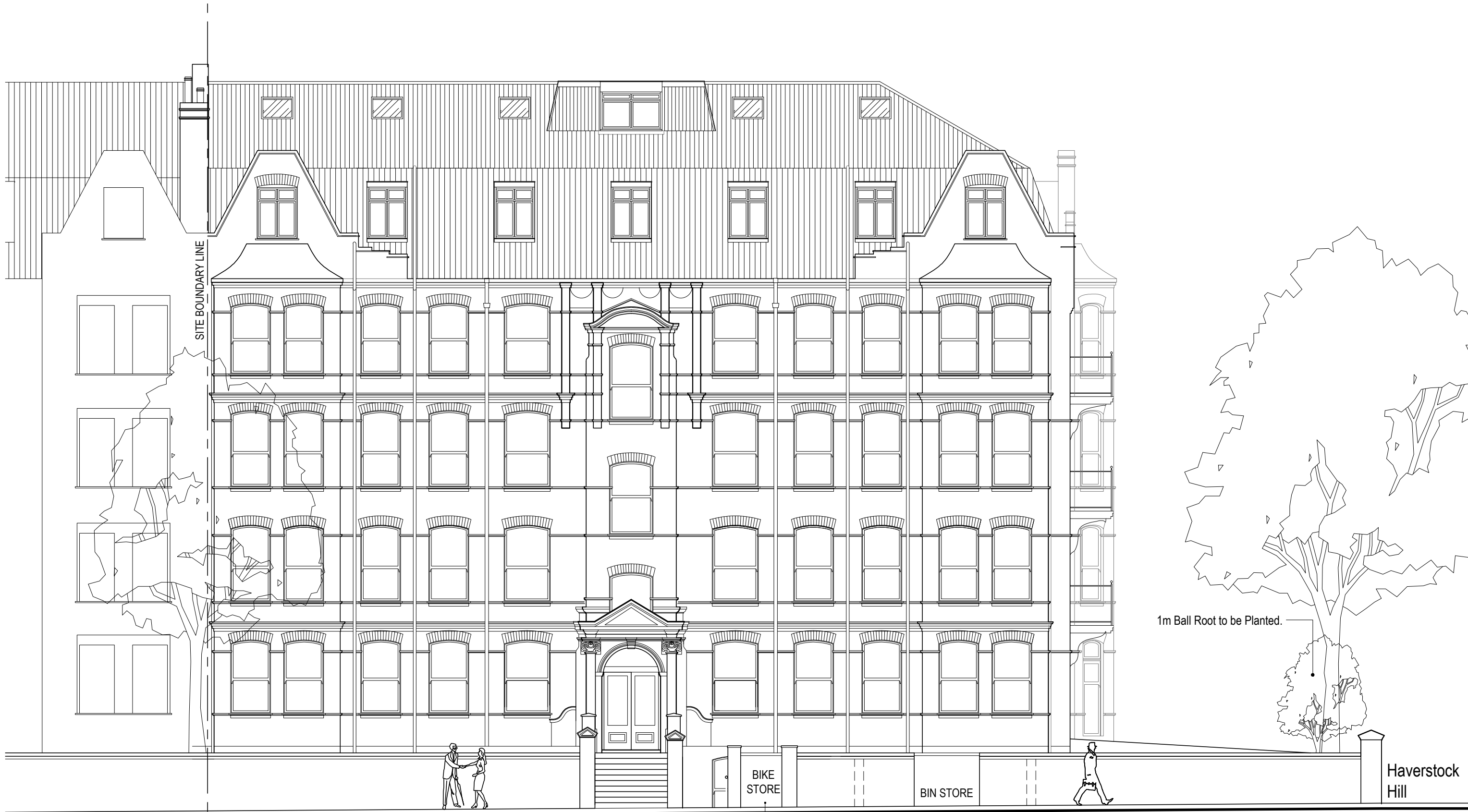
Proposed Street Elevation Scale 1:100 @ A3