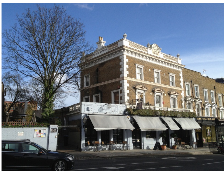
Street view of the existing building

Haverstock Hill is a two way trafficked road (A502) and is a principal vehicular exit from the Camden Town district of London in a North West direction leading to Hampstead and Golders Green and passing the large expanse of Hampstead Heath amenity space.