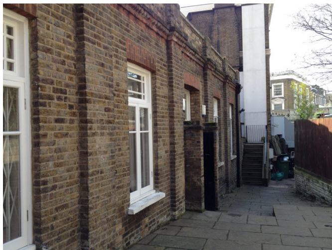
Hays Mews single storey residential unit and access