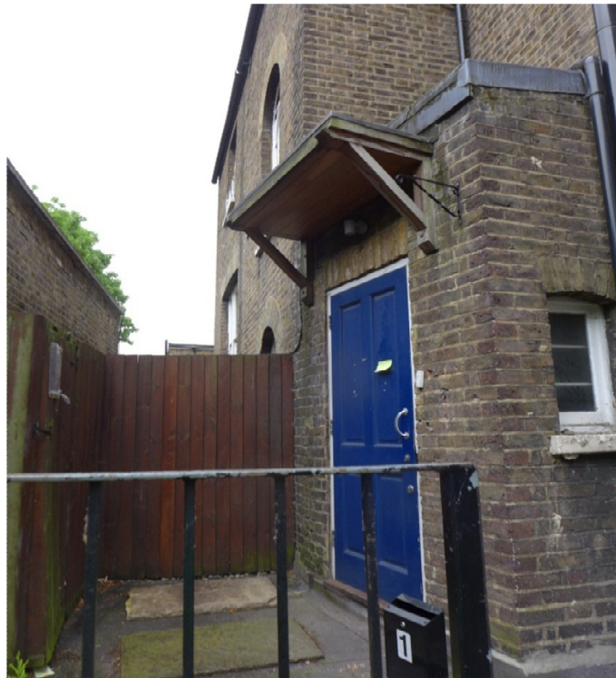
View of rear deck access to common flat stairs