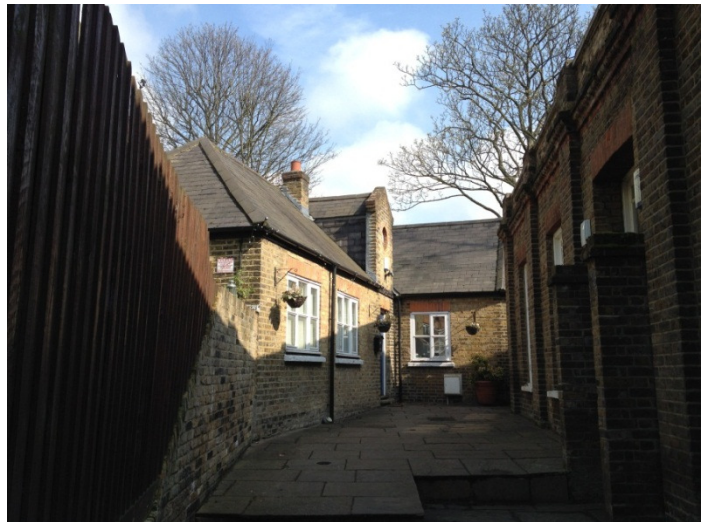
Rear residential units along Hays Mews