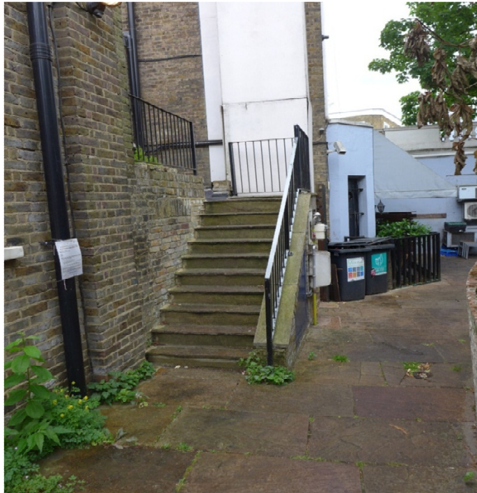
View of rear access steps to flats