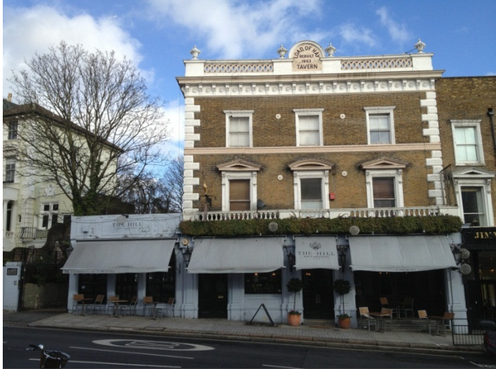
Front view of site showing Hays Mews access on left of single storey element