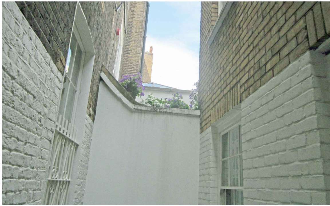
EXISTING BOUNDARY WALL