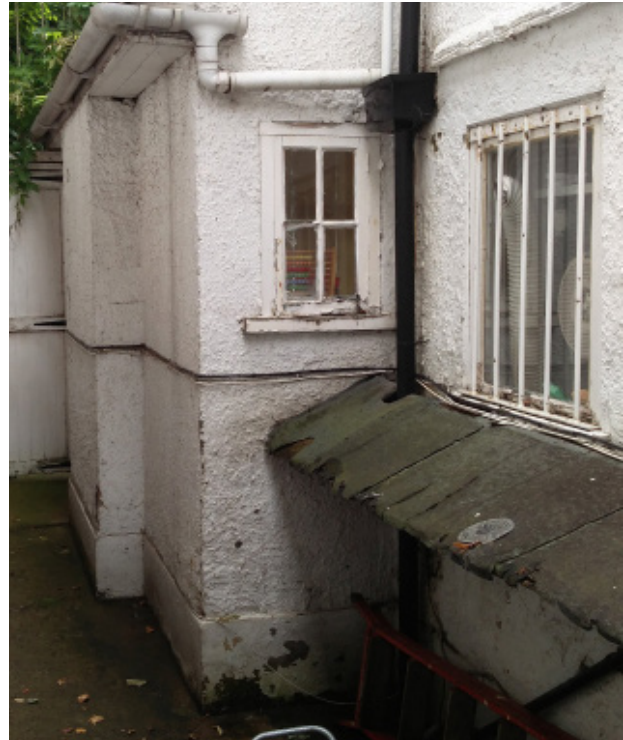
fig 6 & 7. 98 Highgate West Hill - internal and external damp