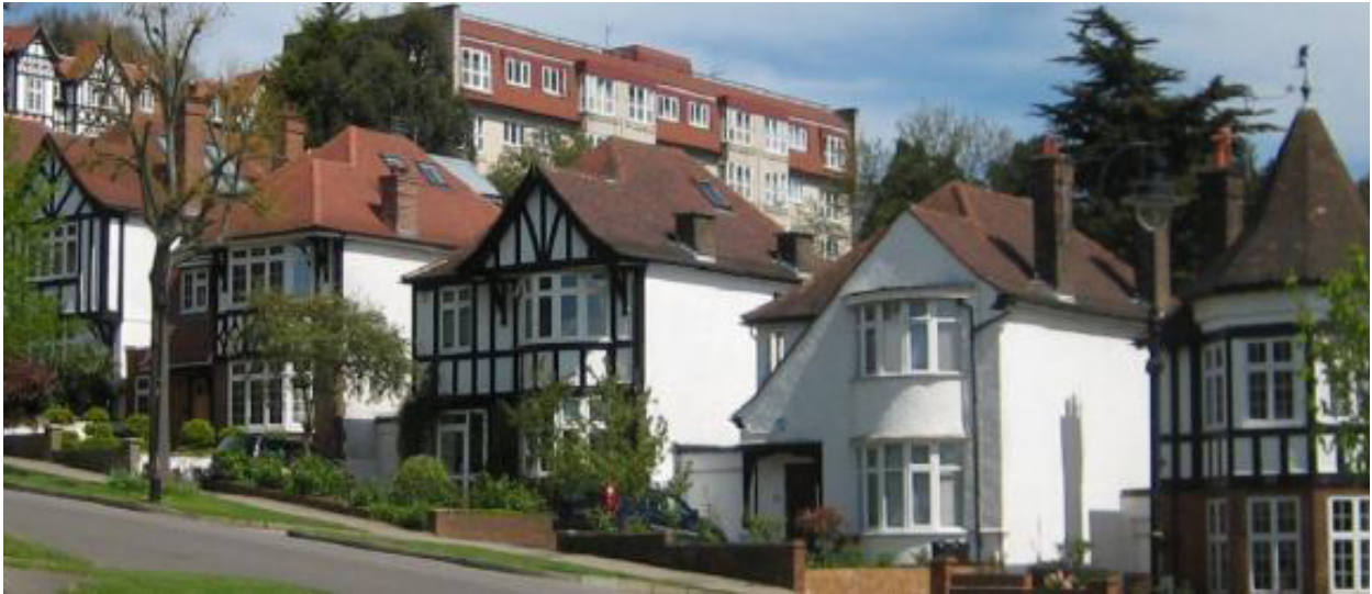
fig 2. Holly Lodge Estate (general image)