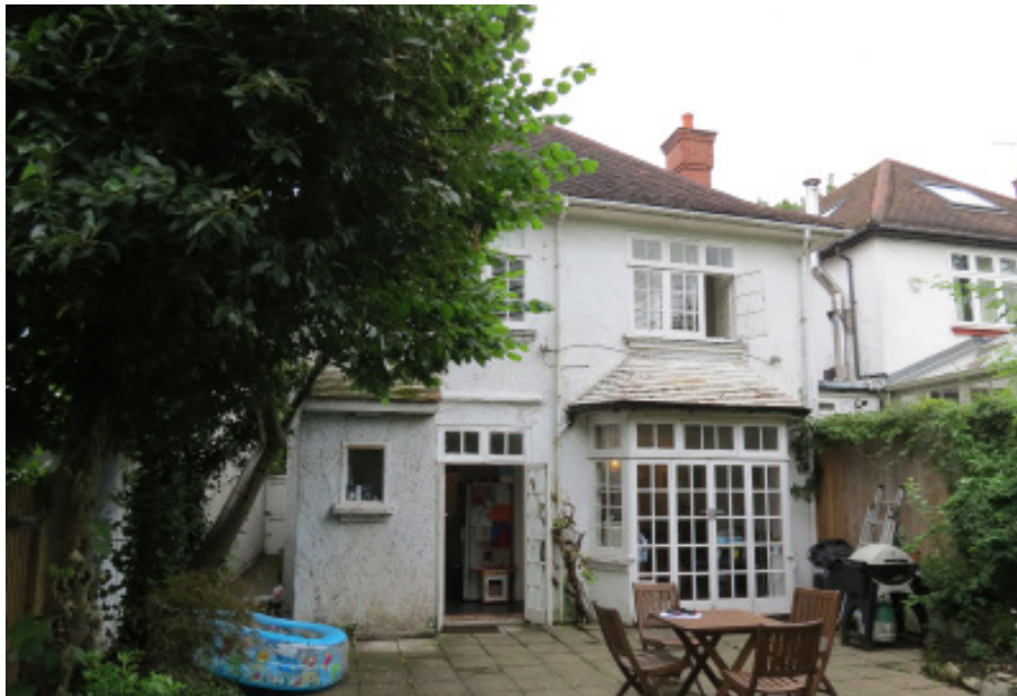
fig 3. 98 Highgate West Hill - Existing rear elevation