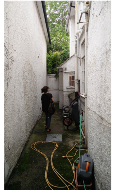
fig 4. 98 Highgate West Hill - side alley way