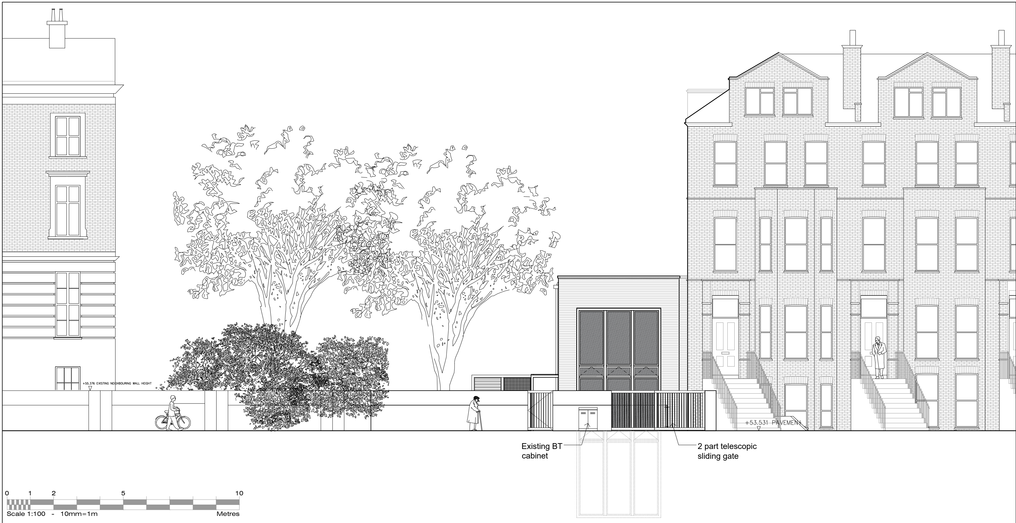
Proposed front elevation - as viewed form street level 1:100 @ A1