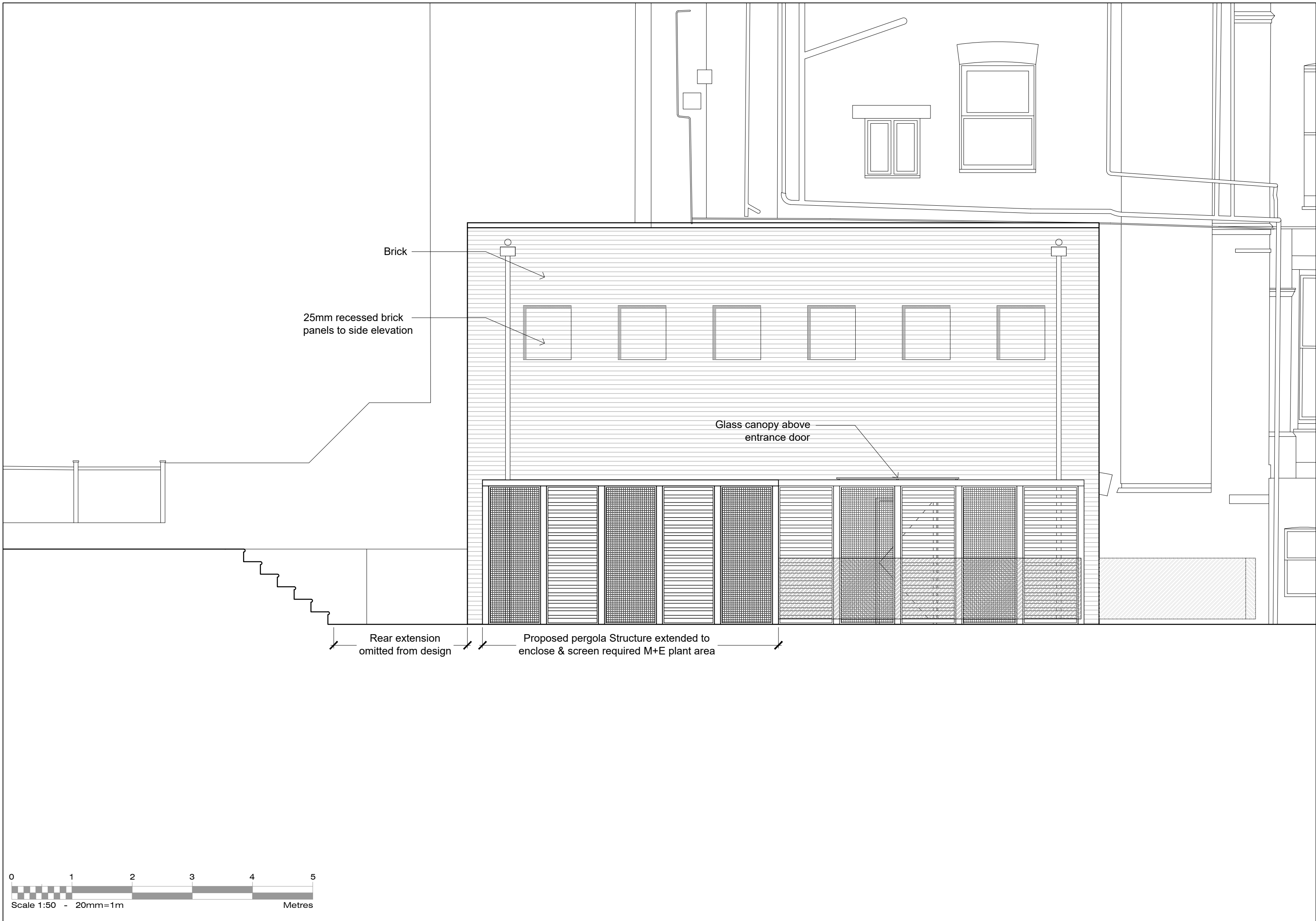
Proposed side elevation 1:50 @ A1