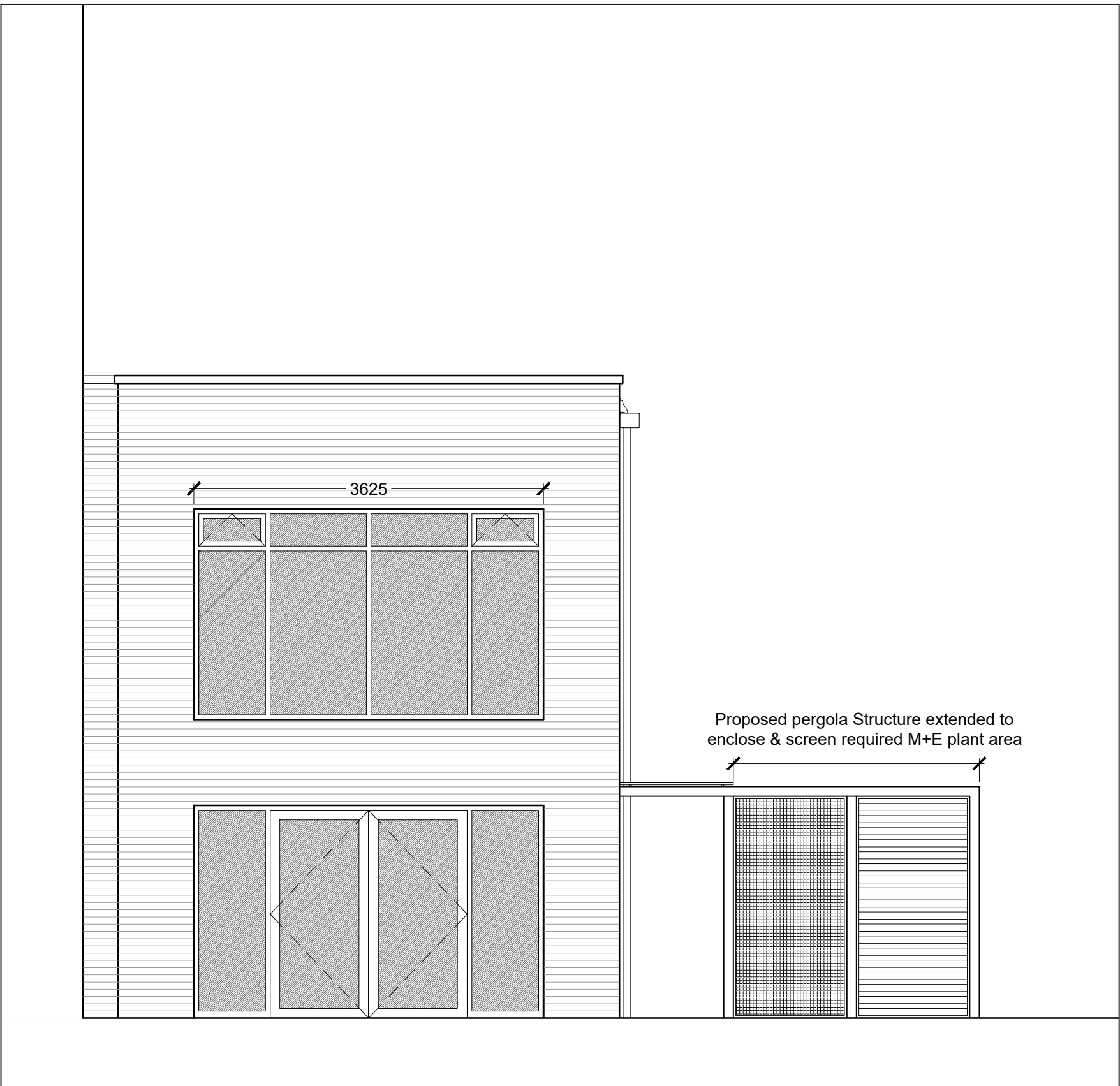
Proposed rear elevation 1:50 @ A1

DO NOT SCALE FROM THIS DRAWING ALL DIMENSIONS TO BE CONFIRMED ON SITE BY THE CONTRACTOR PRIOR TO CONSTRUCTION