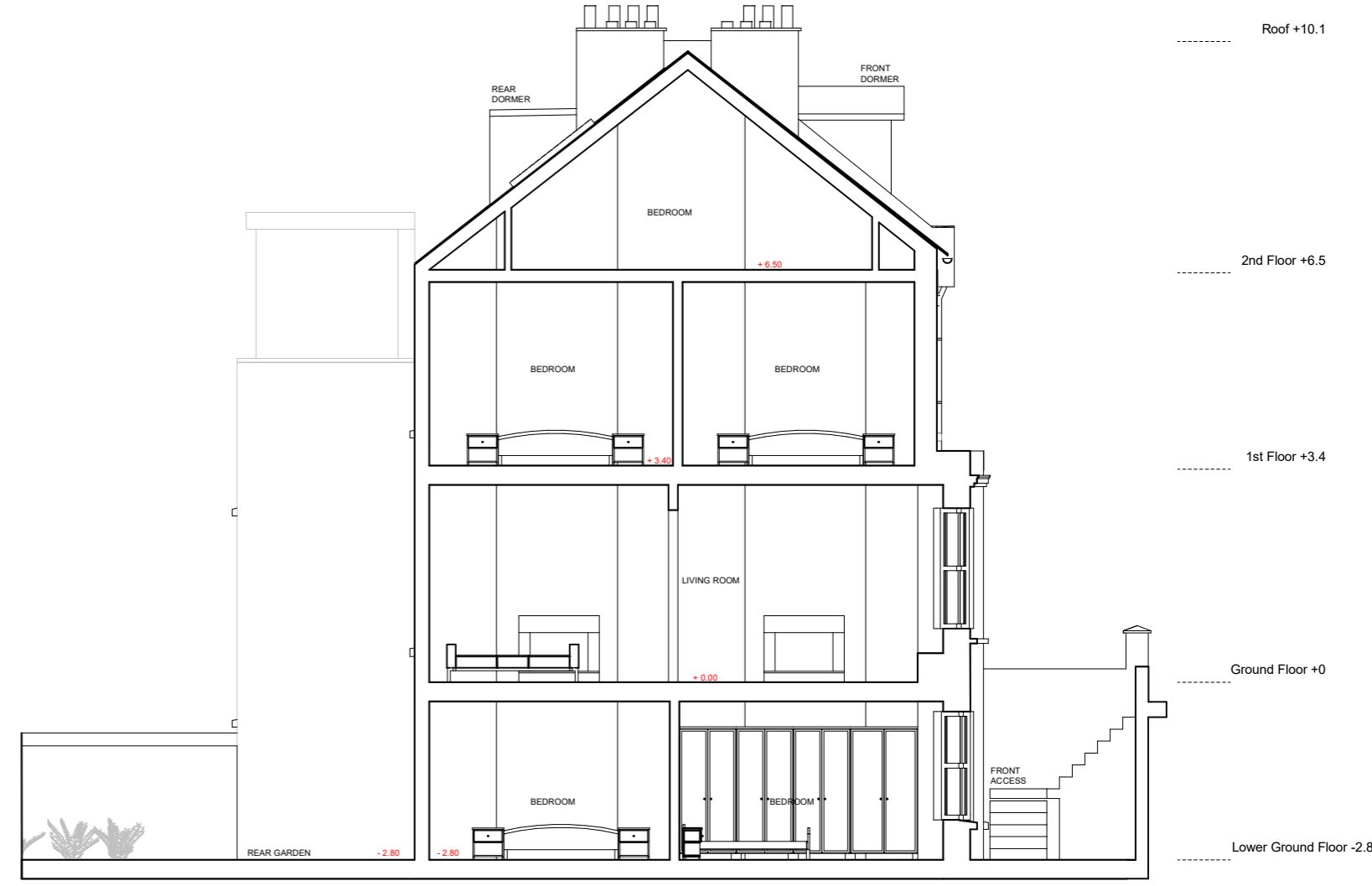
EXISTING SECTION B-BB SCALE: 1:100@A3