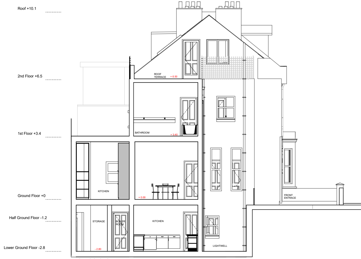
EXISTING SECTION A-AA SCALE: 1:100@A3