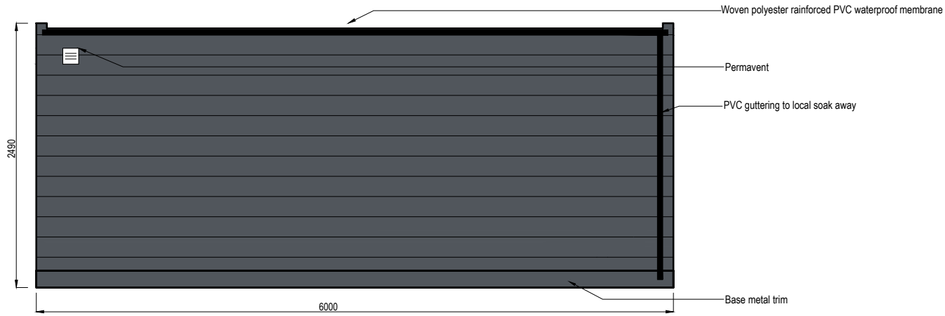
PROP 04 PROPOSED ELEVATION C-C SCALE: 1:50@A4 A4