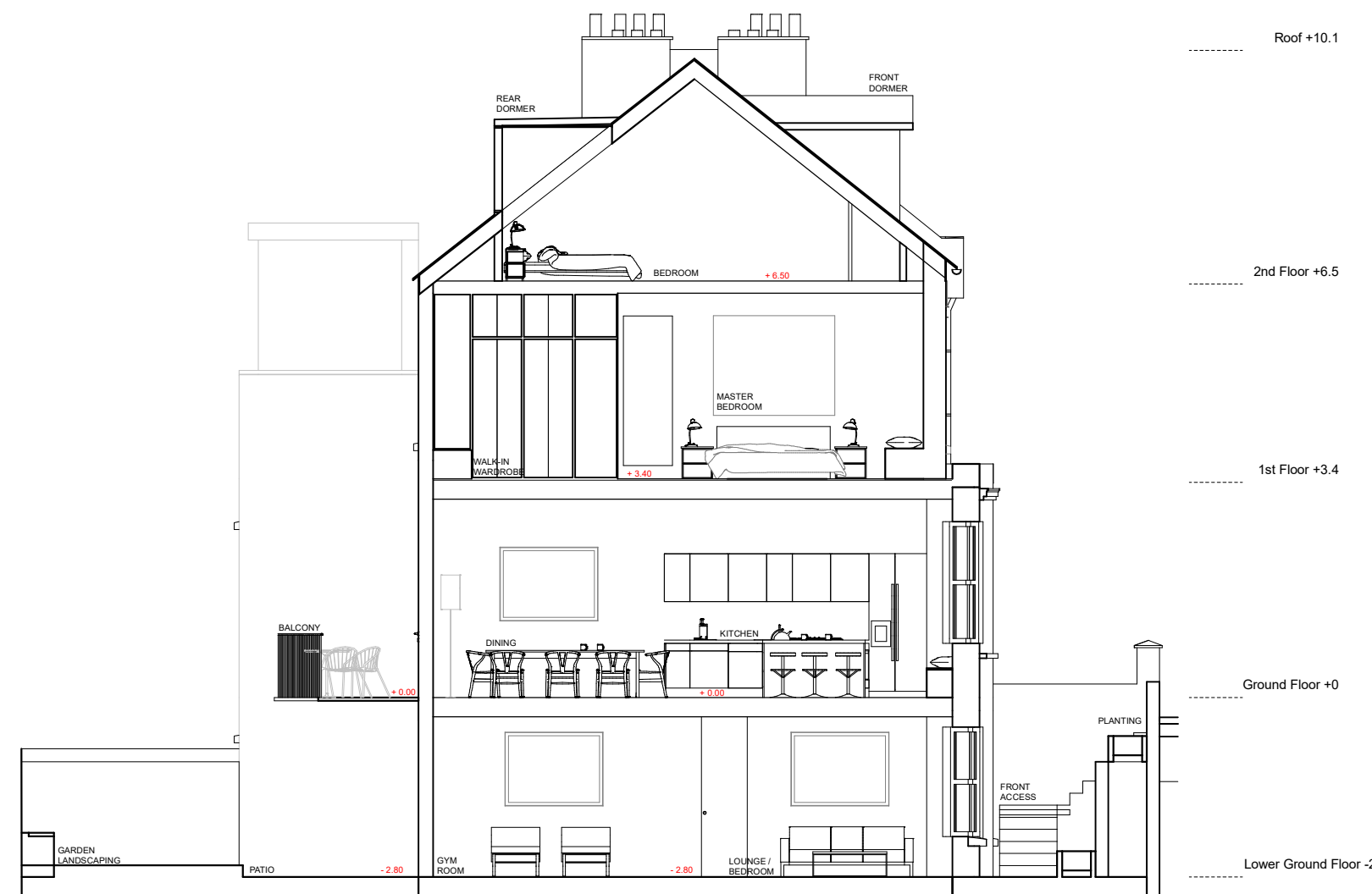
PROPOSED SECTION B-BB SCALE: 1:100@A3