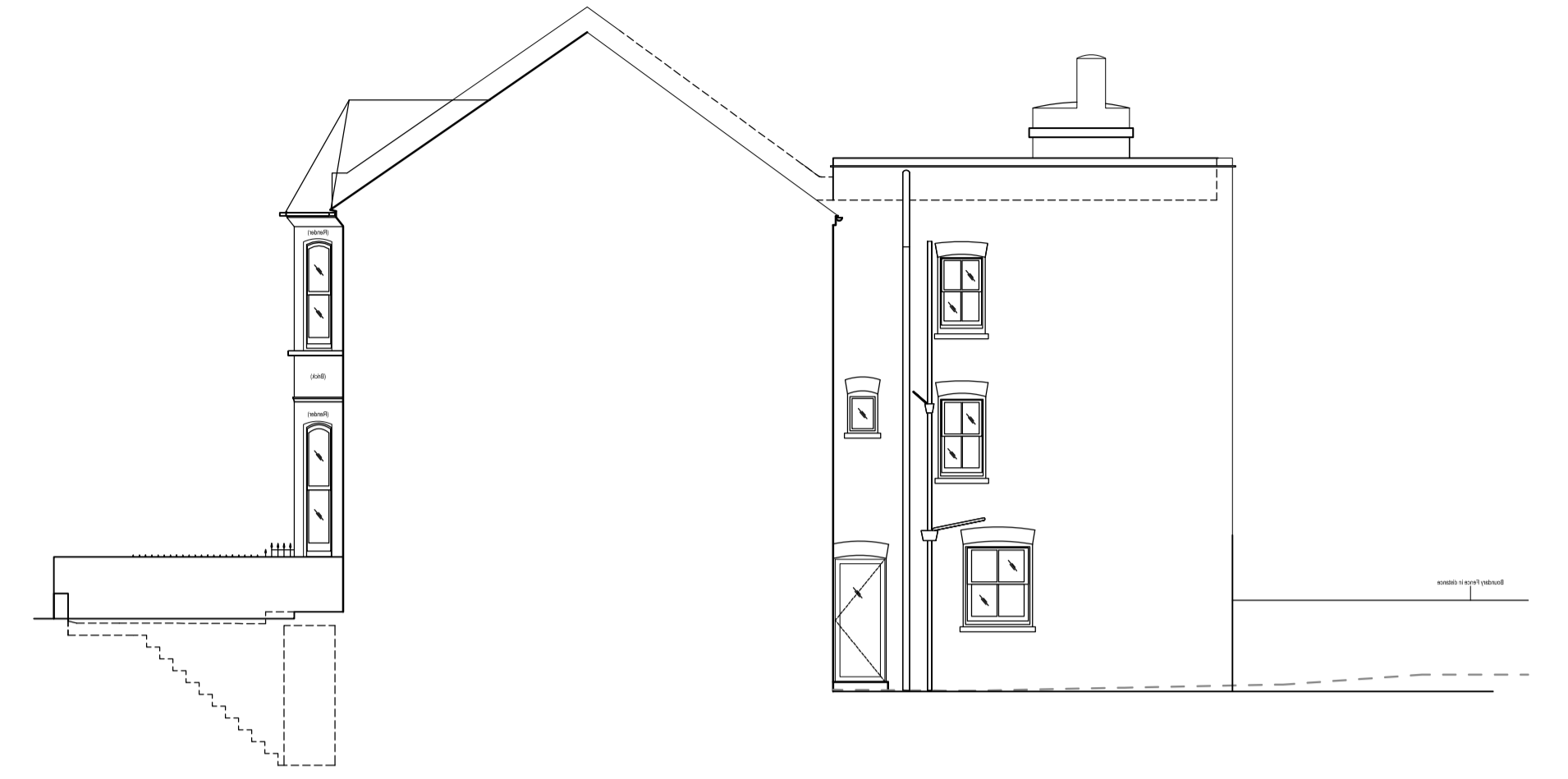
PROPOSED RIGHT SIDE ELEVATION