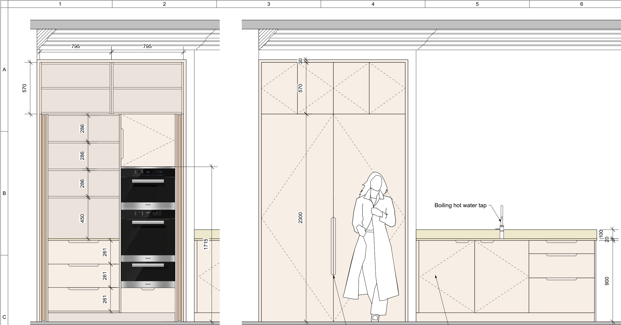
5 Elevation C without doors 1:20