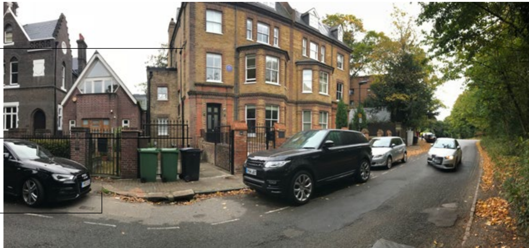
A. Front Elevation - view 1

Existing unused dropped curb in front of neighbour