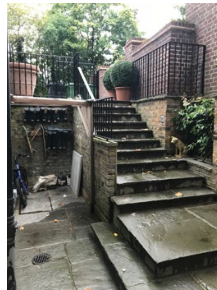
D. Lightwell stairs