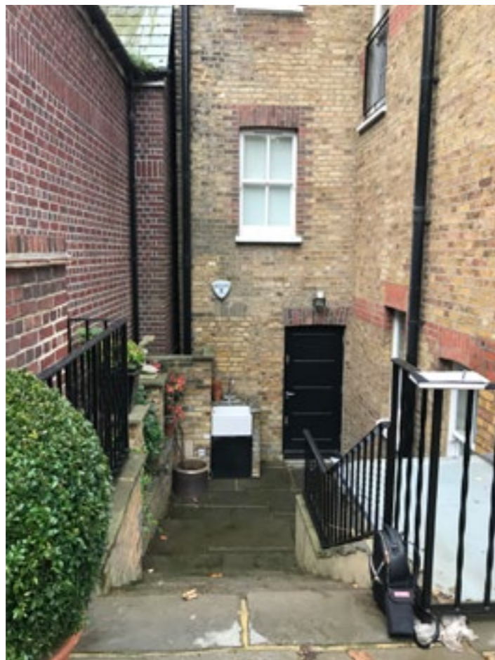
B. Steps down to lightwell