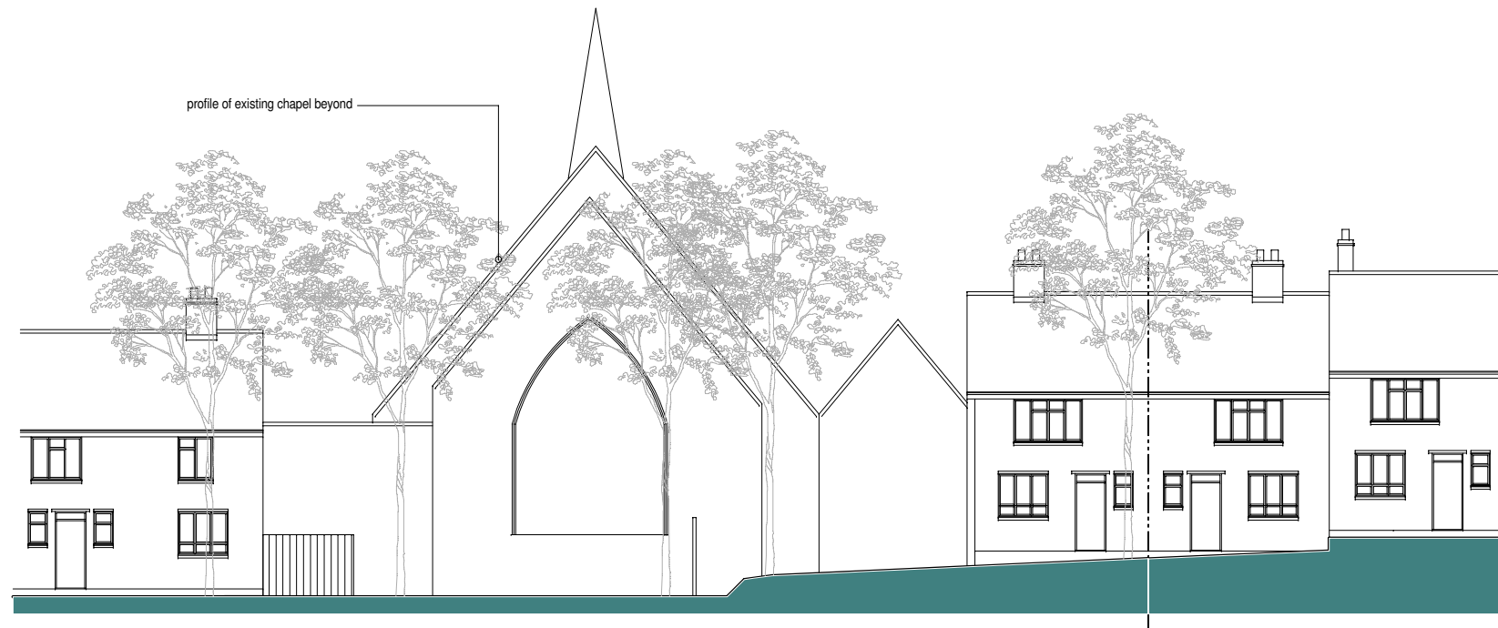
existing street elevation 1:200