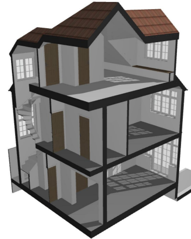
SECTION 3D VIEW