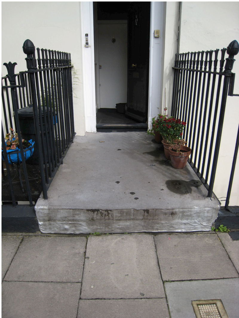
EXISTING 280mm HIGH ENTRANCE STEP