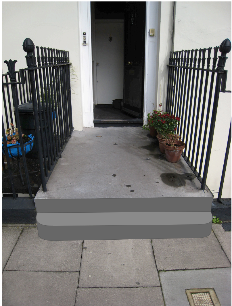
PROPOSED MODIFICATION (2 x 140mm HIGH RISERS)

Rev B (12/10/2017) - new step revised following advice from conservation officer