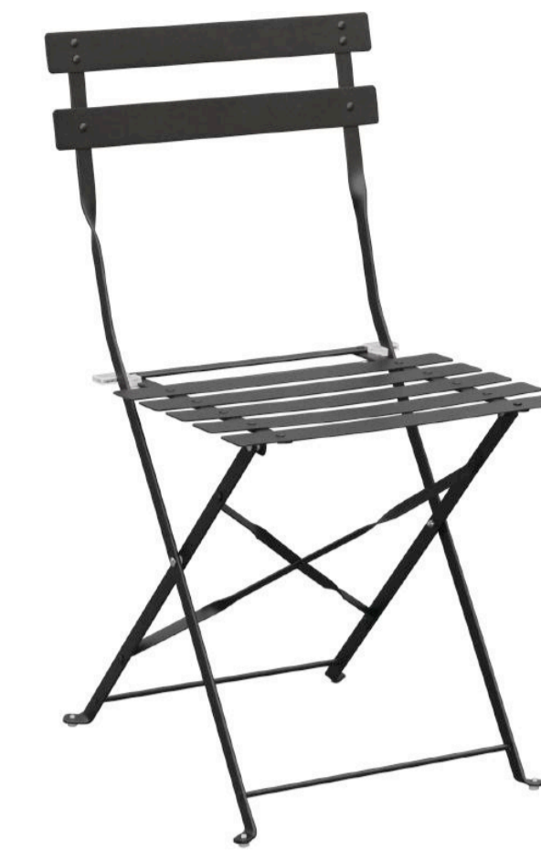
Bolero Pavement Style Steel Chairs in black