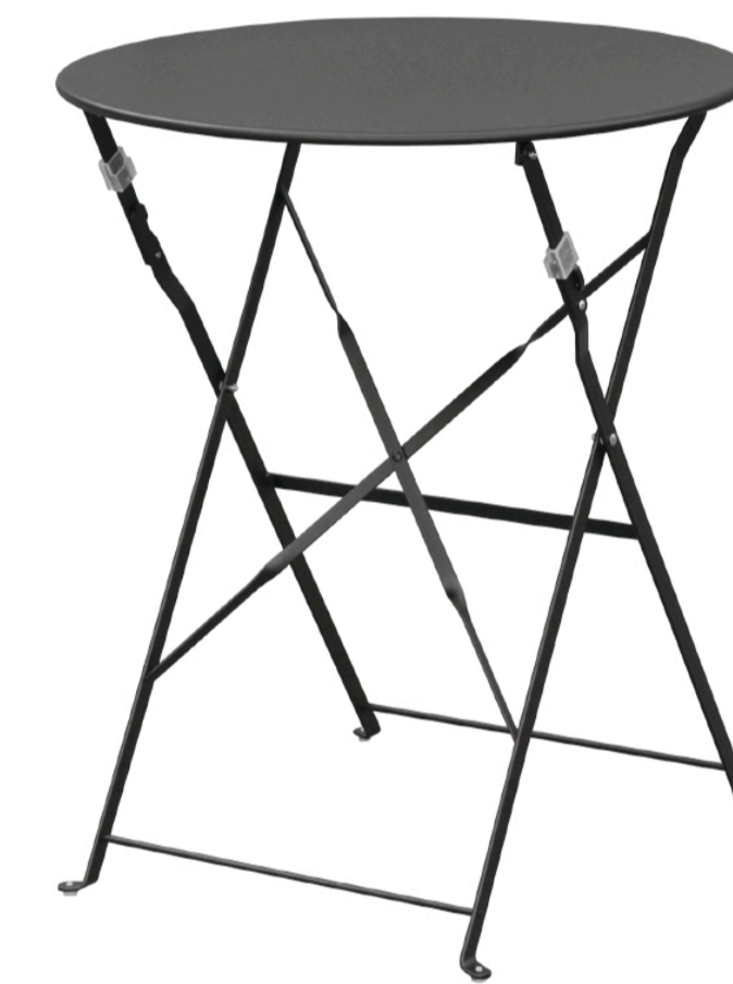
Bolero Pavement Style Steel Table 595mm in black