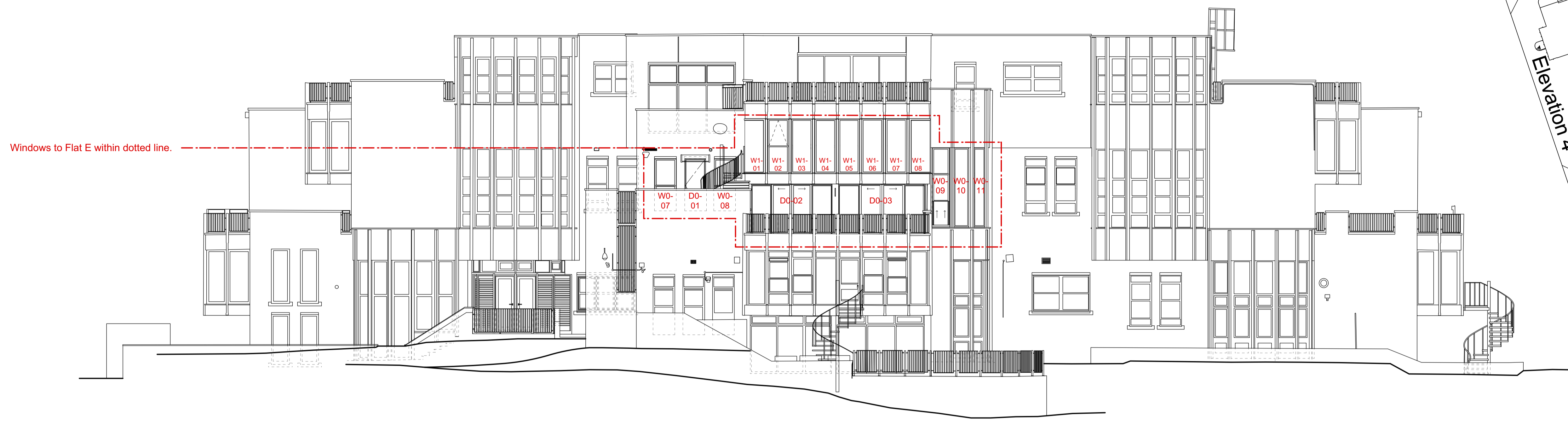
125.000m AOD Elevation 1