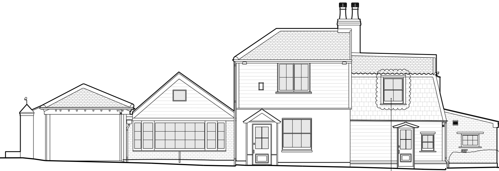
SE 300 Proposed South-East Elevation