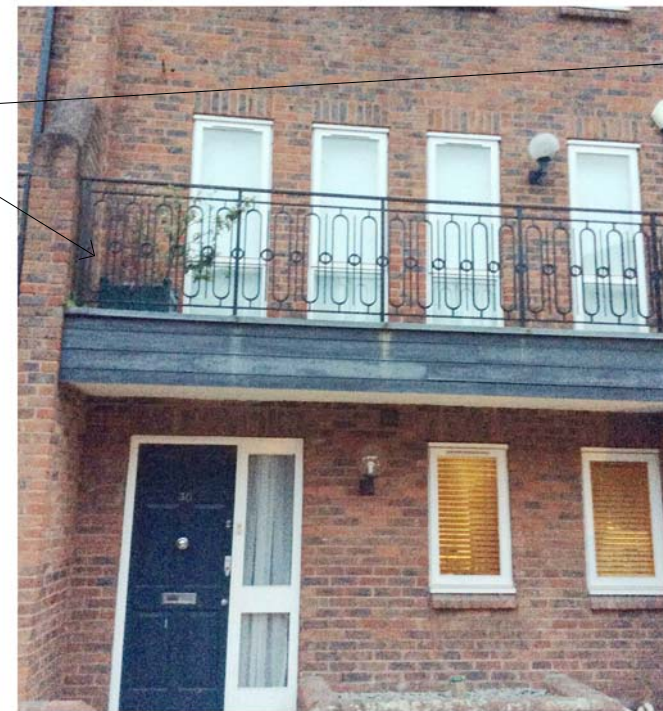
5 Property address 33 Spencer walk