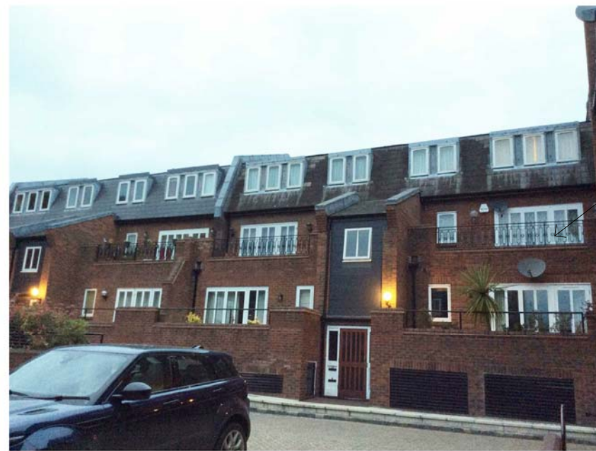
3 Property address 11 & 12 Spencer Walk