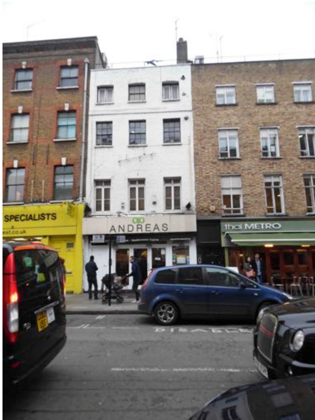
PH1- Front view of Andreas Restaurant no. 40 Charlotte Street.