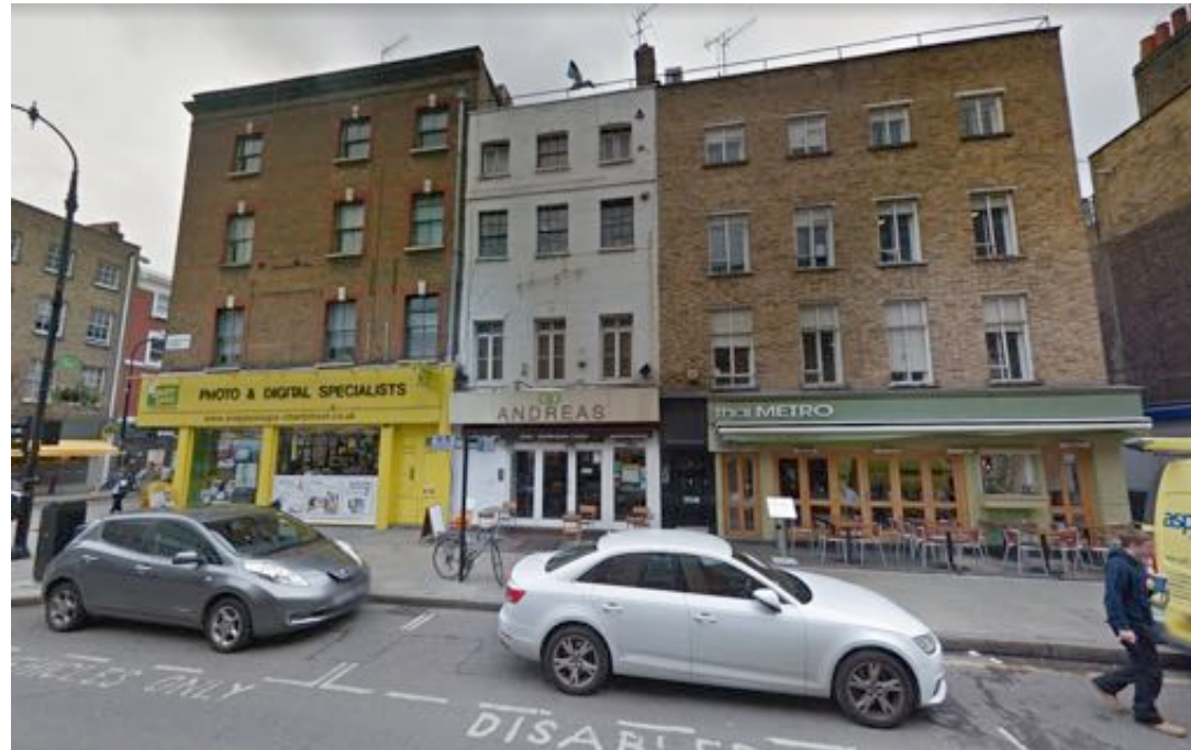
PH2- Front view of nos 40, 42 & 38 Charlotte Street.