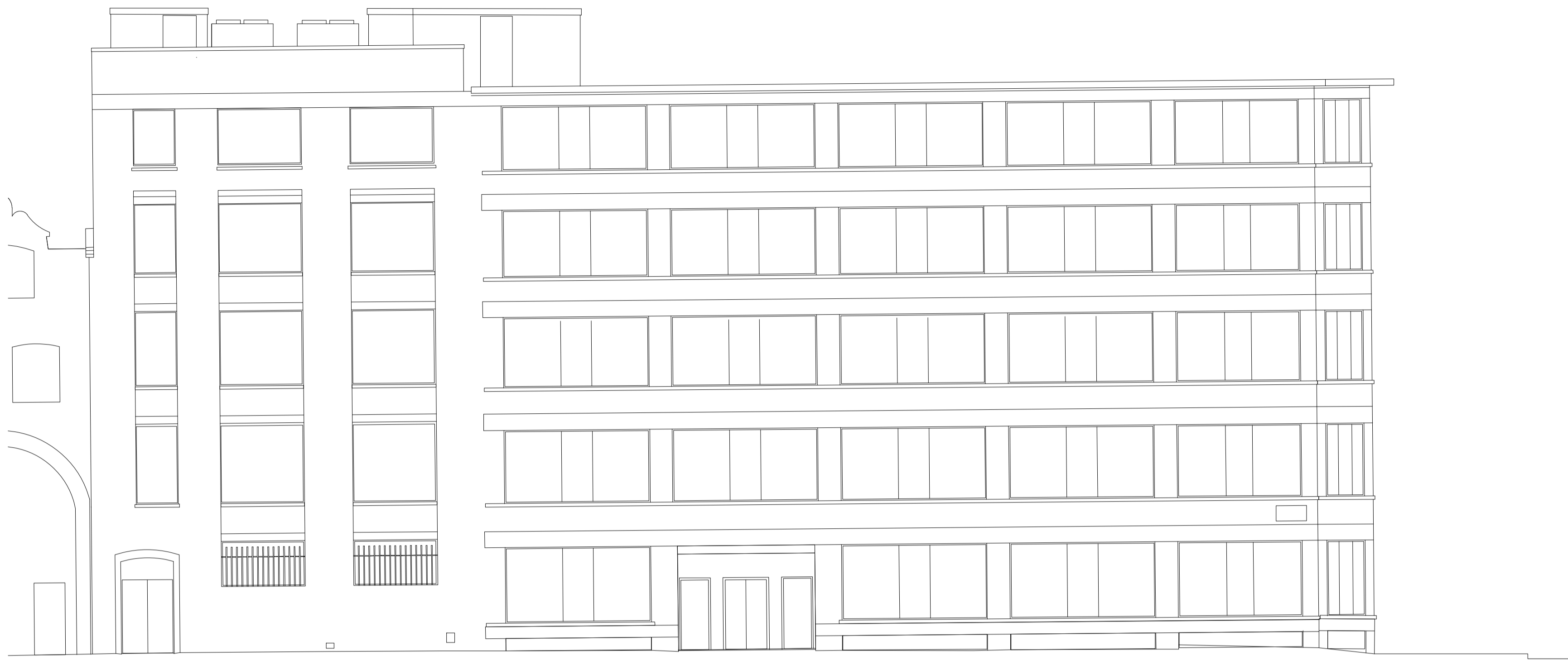
EXISTING STANHOPE ROAD ELEVATION