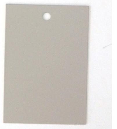
PPC colour samples RAL7044

-A213-(21)-201 to 204 External Wall Types Key