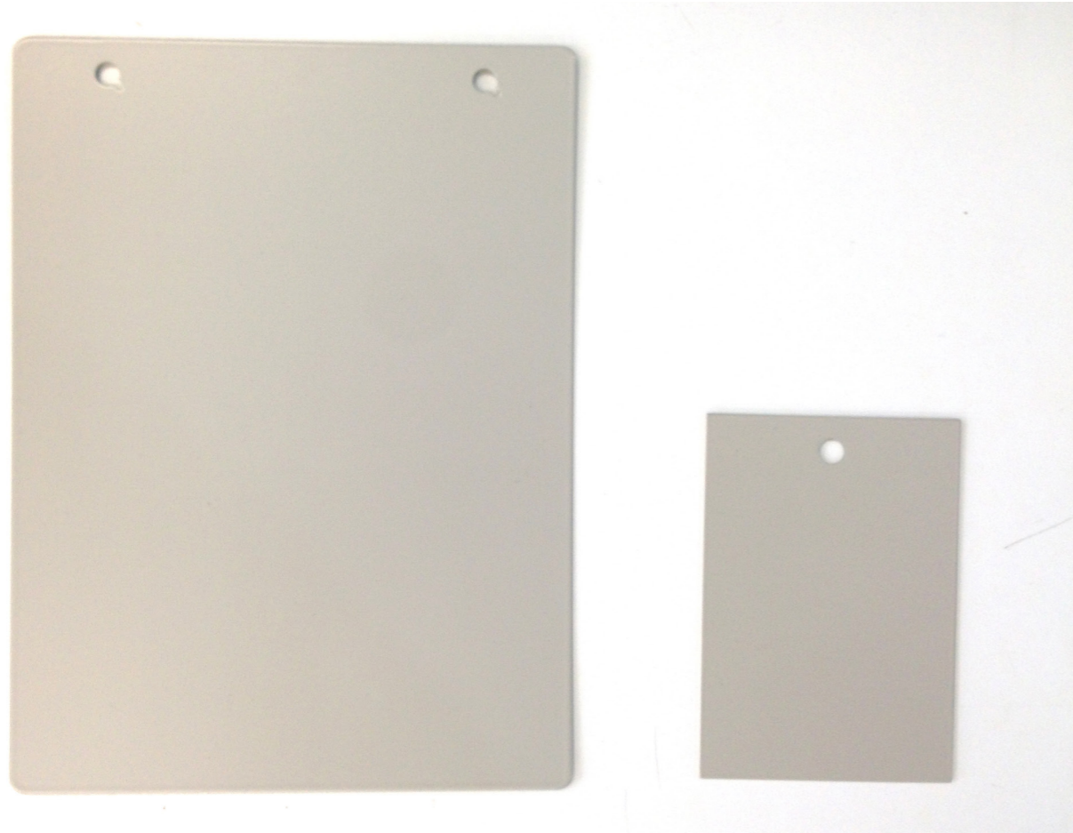
All metalwork to the facade to match RAL7044