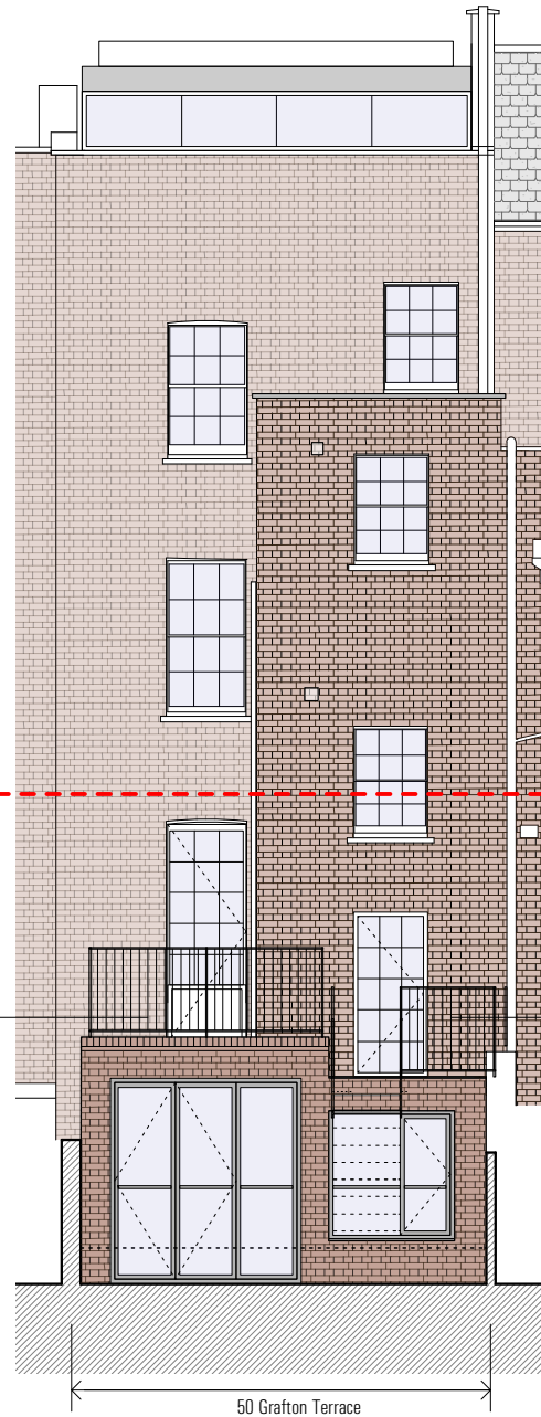
Rear Elevation 1/100